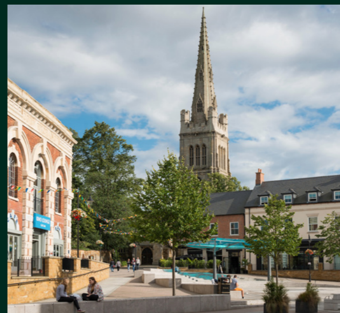
Market Place, Kettering

For trips even further afield, Birmingham, Stansted and Luton Airports can all be reached in around an hour, between them offering flights to hundreds of destinations around the world.