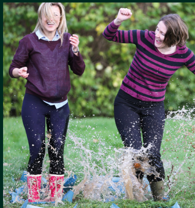
Puddle Jumping at Wicksteed Park, Kettering

Orbit Homes at Hanwood Park is ideally located close to excellent transport links that connect you to some of the country's most exciting destinations.