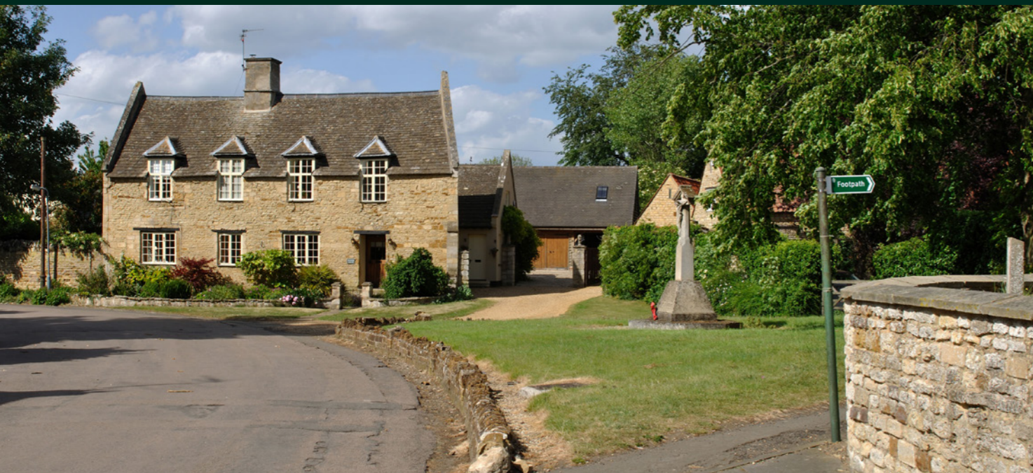
Barton Seagrave Village