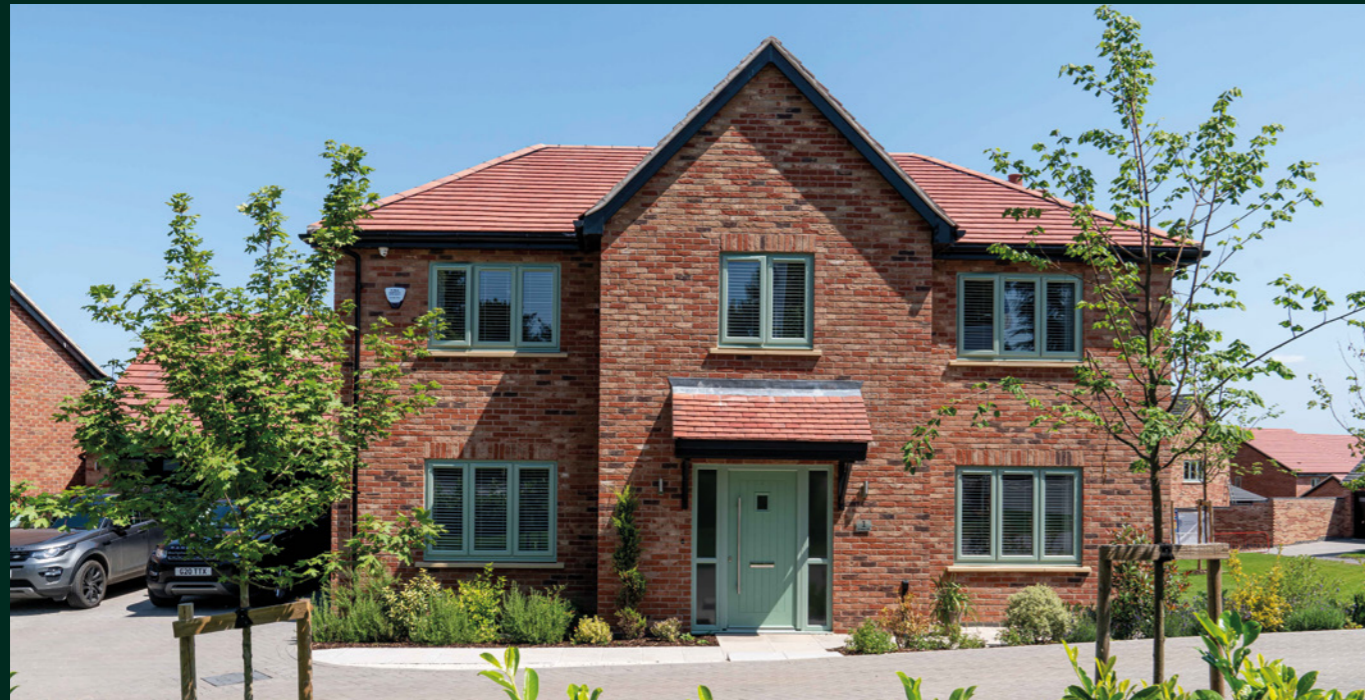
Chapel View, Shipston-on-Stour