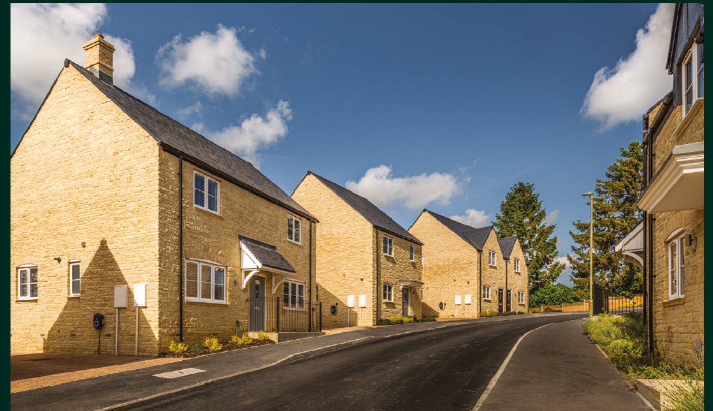
Enstone Leys, Enstone, Oxfordshire