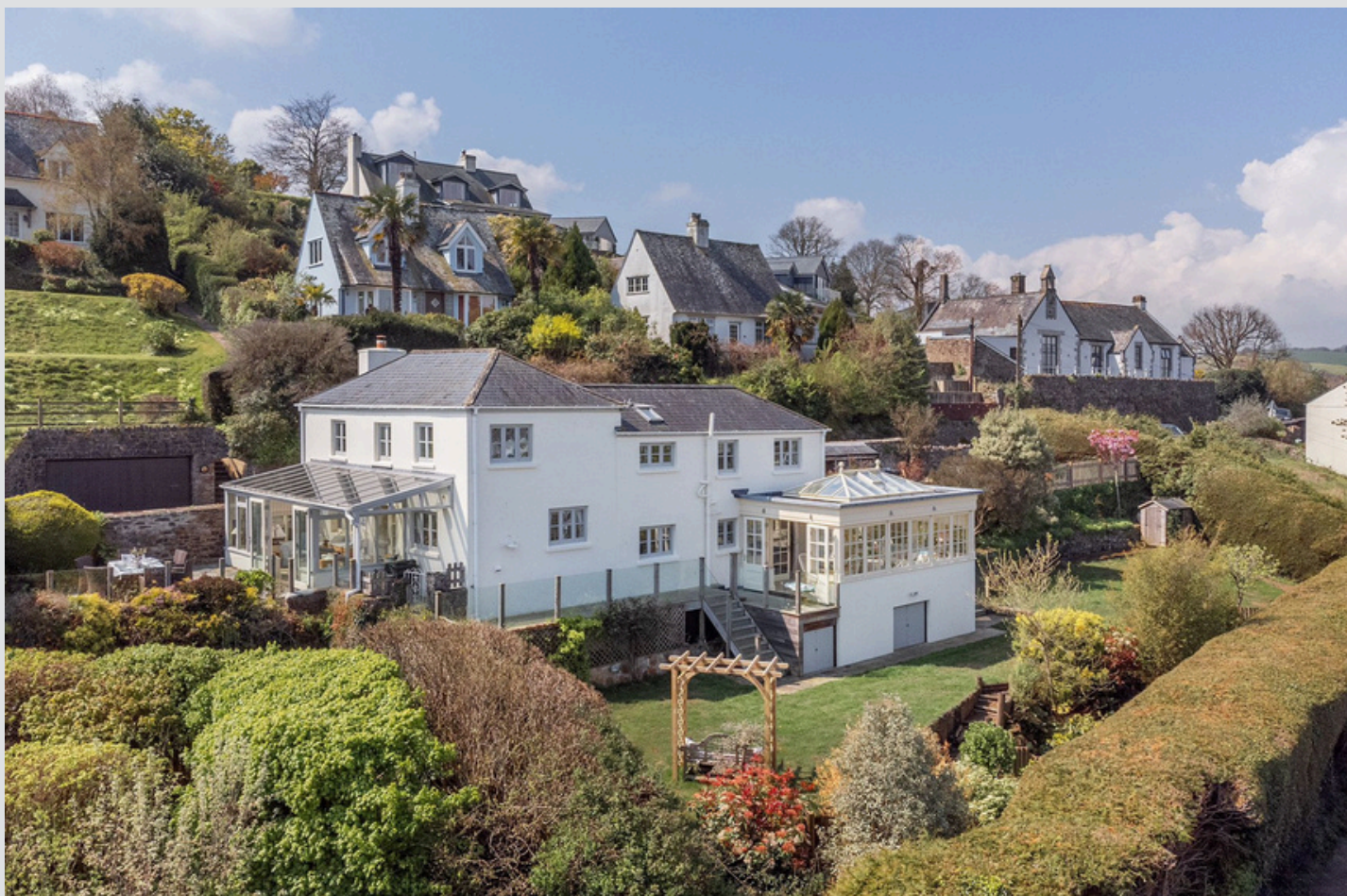
Dart View Cottage THE LEVEL.DITTISHAM