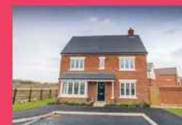
Great Denham, Bedfordshire