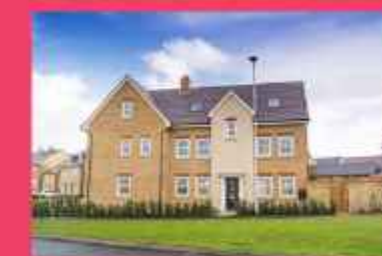
Willow Grove, Wixams