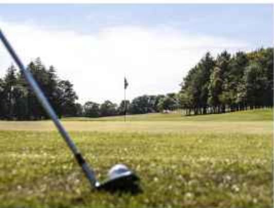
Images from left to right: Royston Golf club Royston Splash Park Cambridge Cambridgeshire woodland