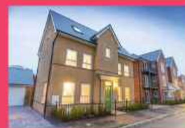
Brooklands, Milton Keynes