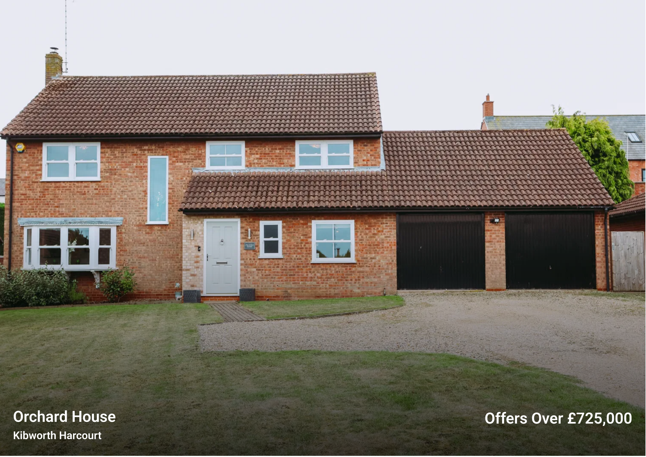
Orchard House Kibworth Harcourt