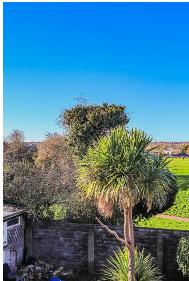
The Gazelles, Pencoeudre Road, Barry, CF63 1SE