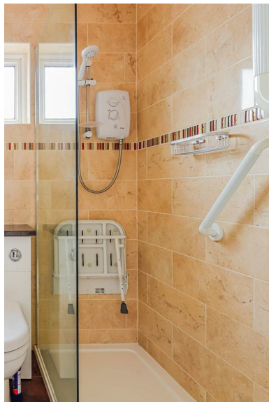
Cliff Wood View, Barry, CF62 6RU