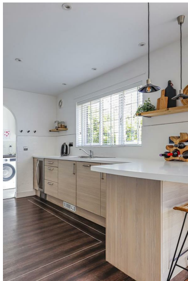
Porfa Ballas, Rhooose, CF62 3LF