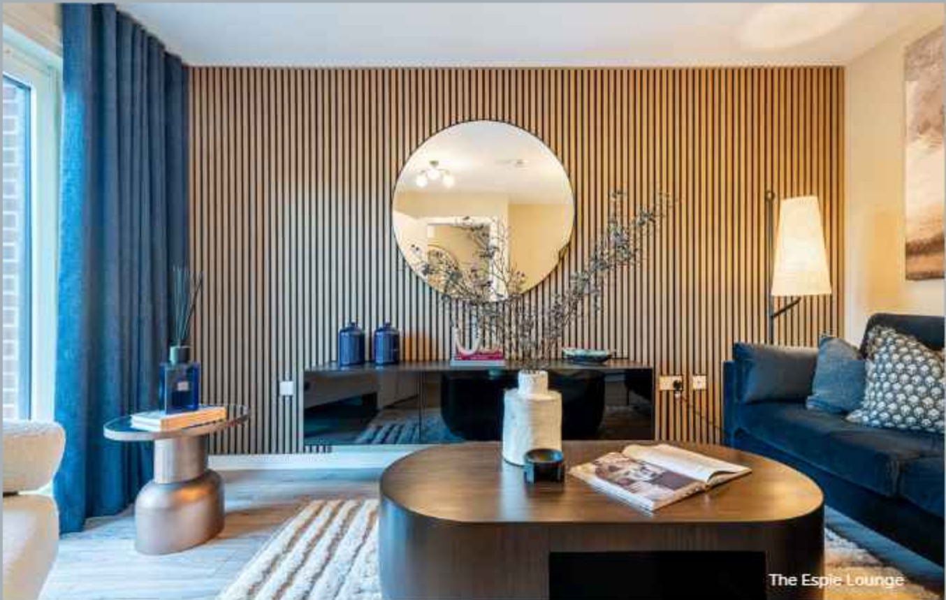
The Esple Lounge