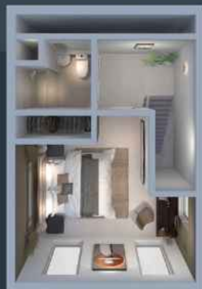
Cupboard on selected plots only