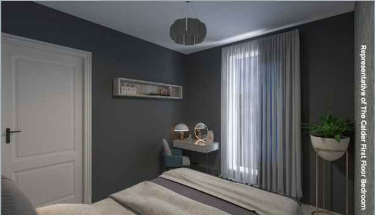
Representative of The Calder First Floor Bedroom