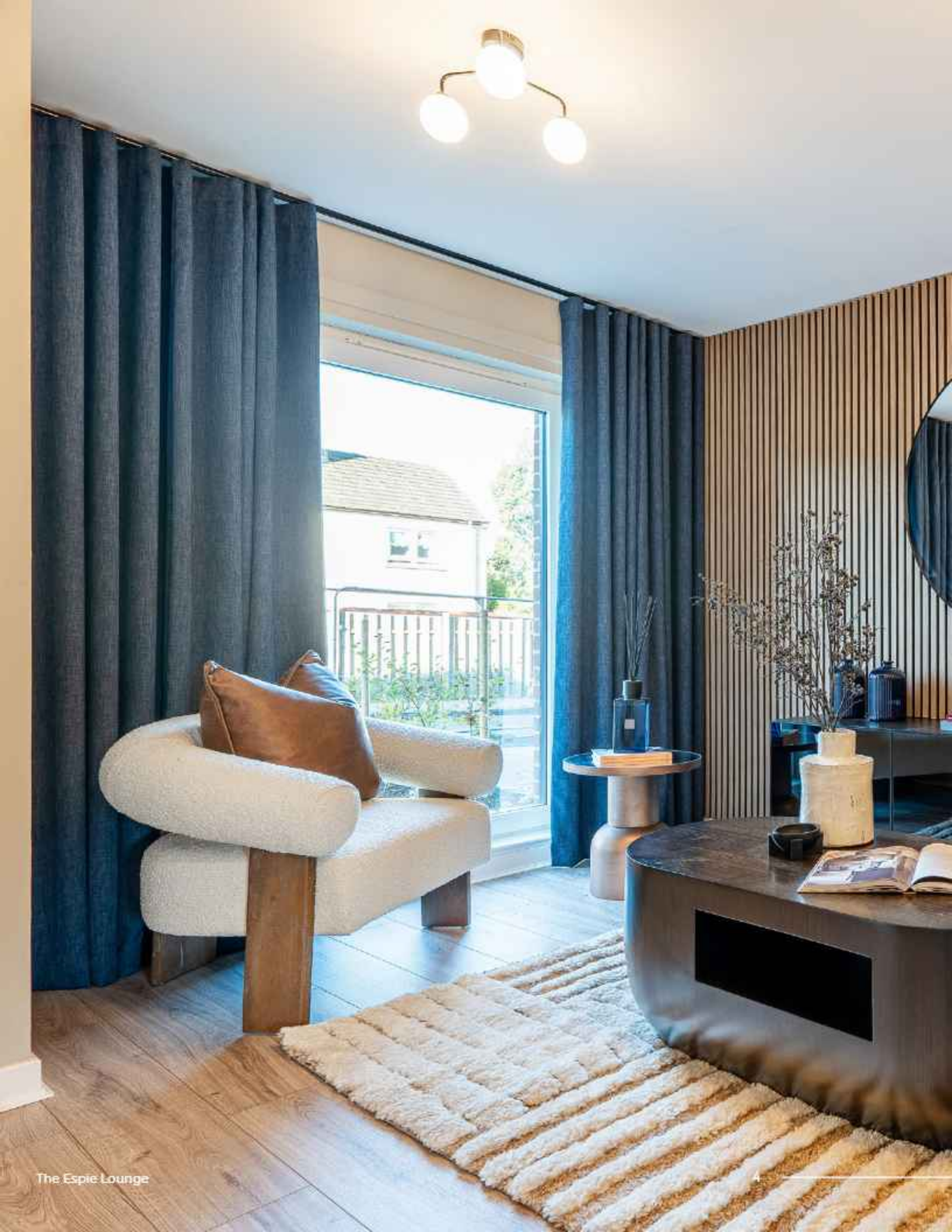
The Espie Lounge