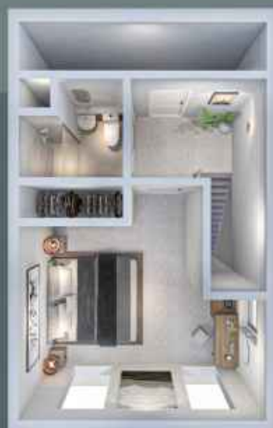
Cupboard on selected plots only