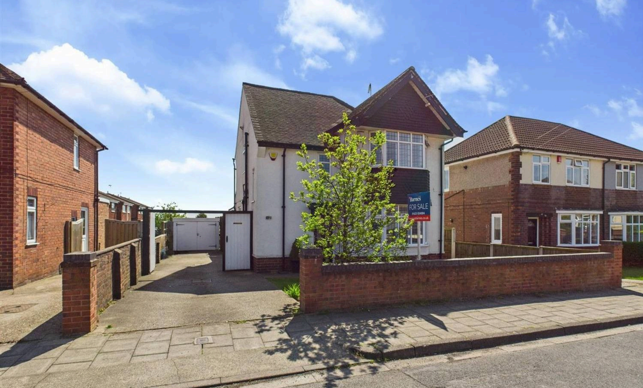
12 Dorothy Drive, Forest Town, NG19 0ES £290,000