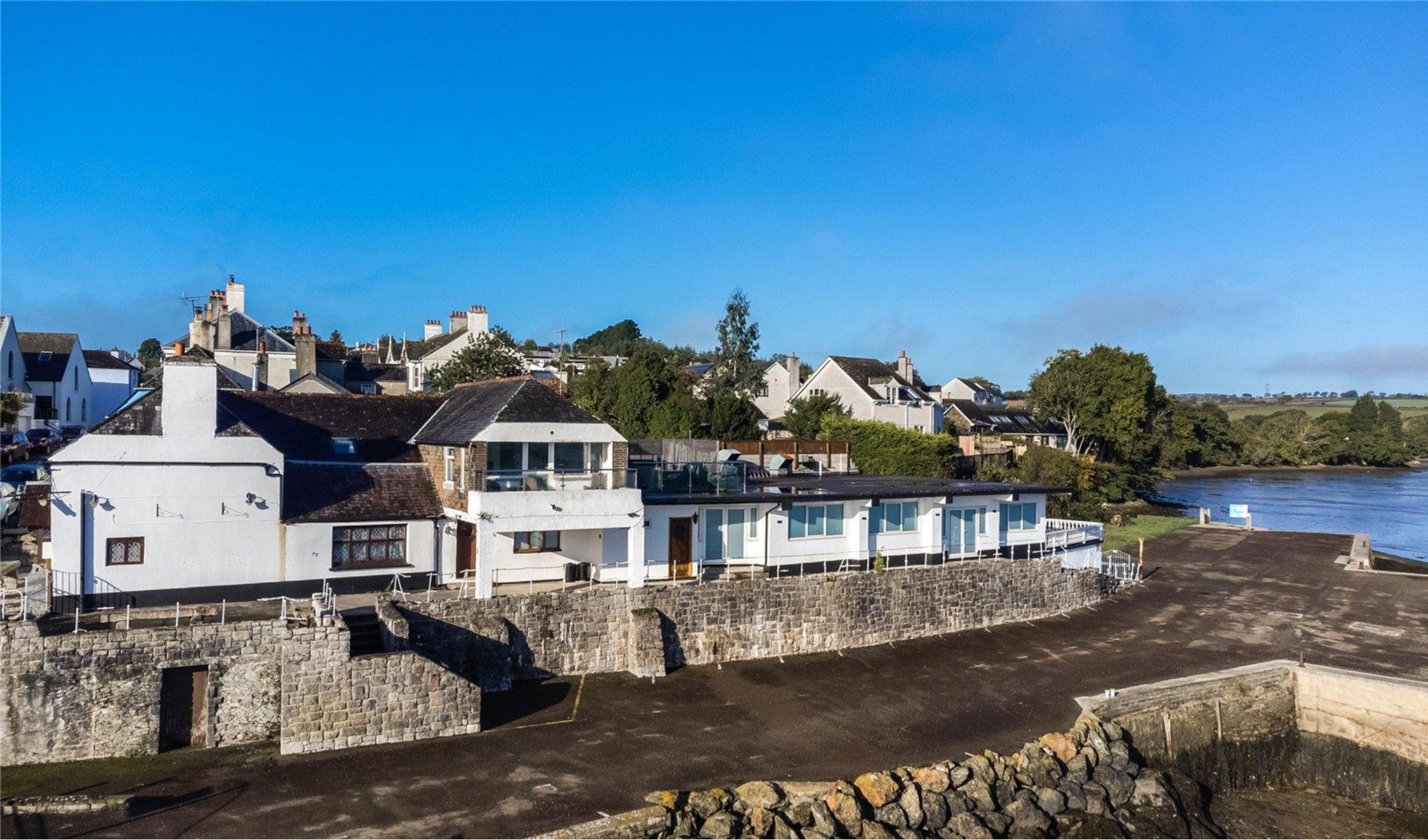
The Spainards Inn Fore Street | Cargreen | Cornwall | PL12 6PA