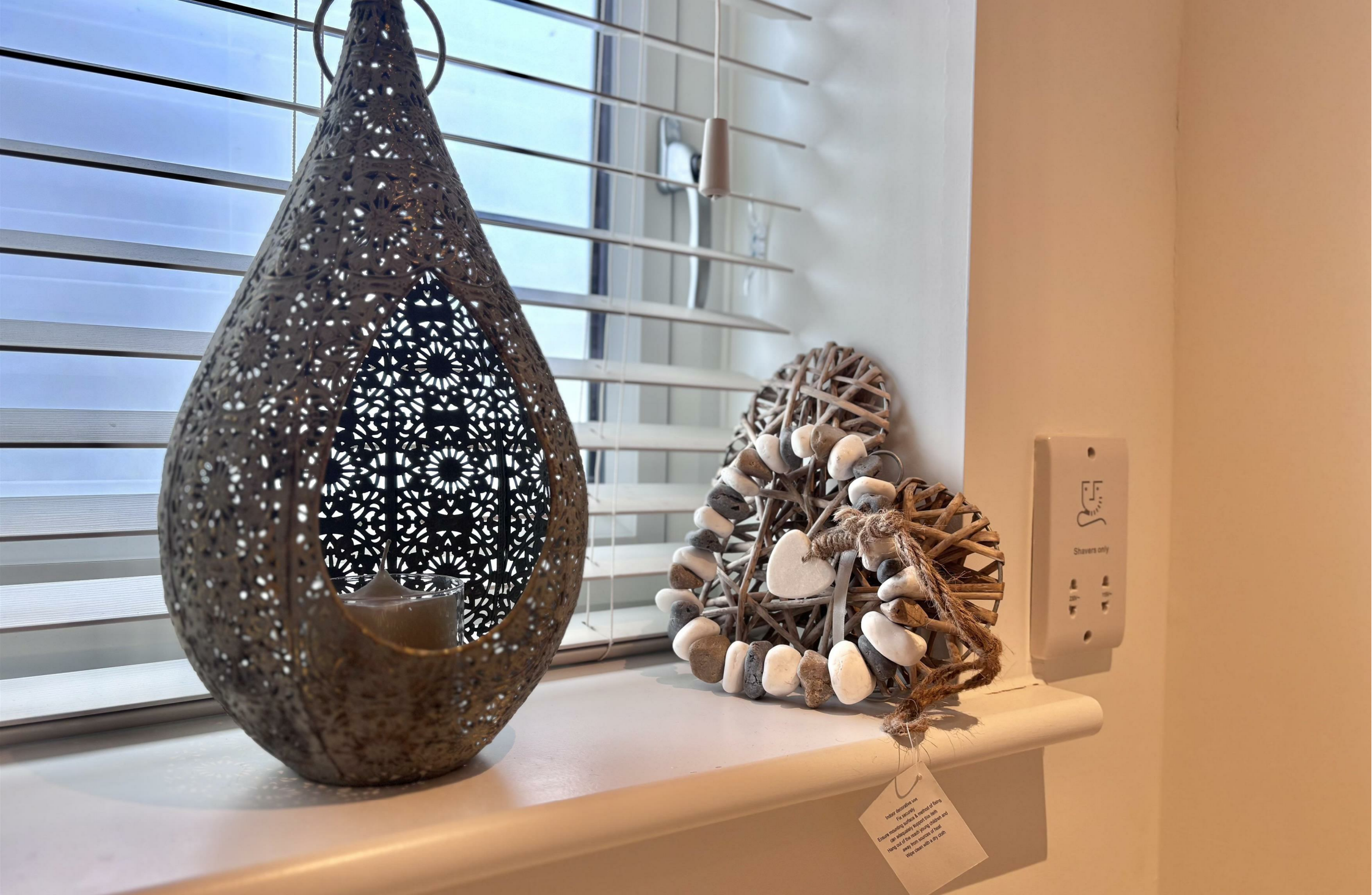
Bluebarrow Close, Carluddon, St. Austell, PL26 8WX