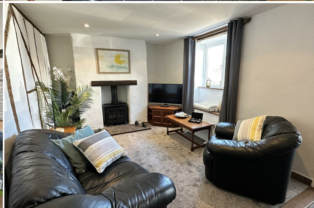
Greens Cottages, Trehan, Nr Saltash, PL12 4QJ