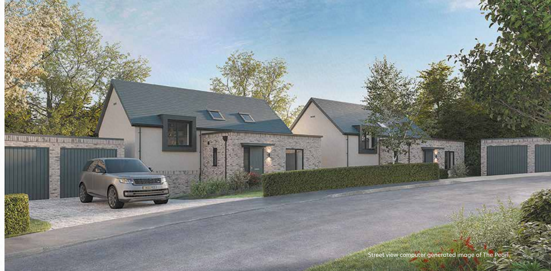
Street view computer generated image of The Pearl.