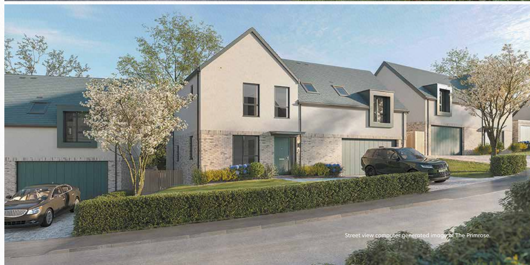
Street view computer generated image of The Primrose.