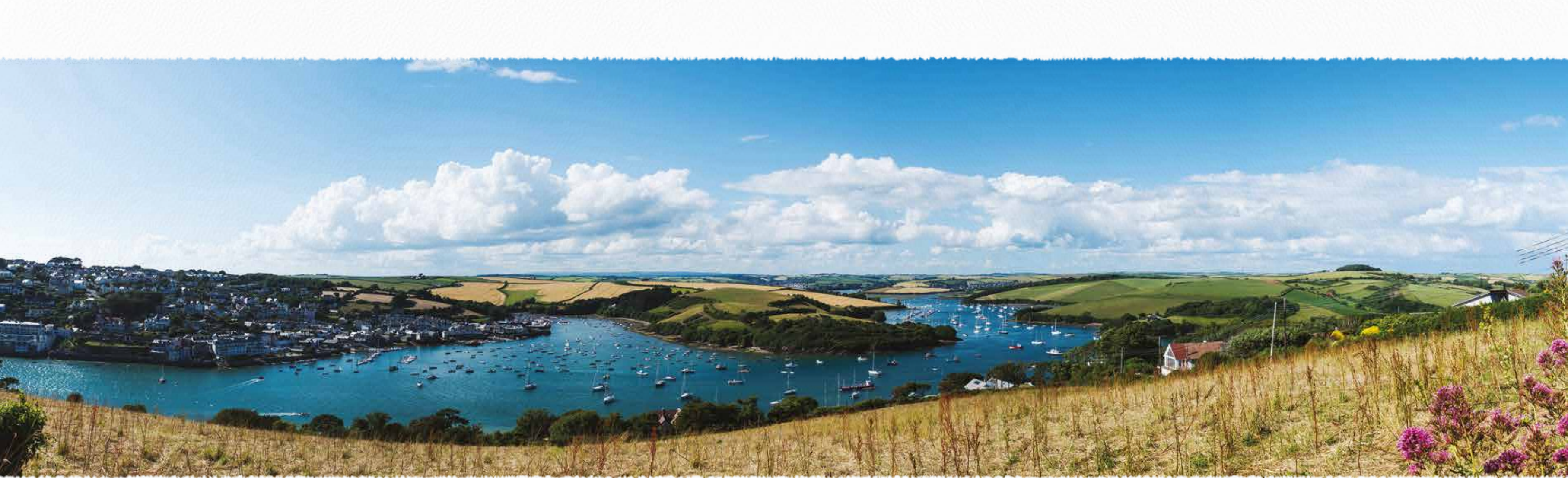
Salcombe and East Portlemouth