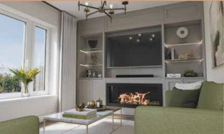
Internal computer generated images of The Pearl and The Primrose.

These details are intended to give a general indication of the development and do not form part of any contract. Acorn Property Group reserves the right to alter any part of the development or specification at any time. These details are believed to be correct but neither the agent nor Acorn Property Group accept the liability whatsoever for any misrepresentation made either in these details or orally. January 2025.