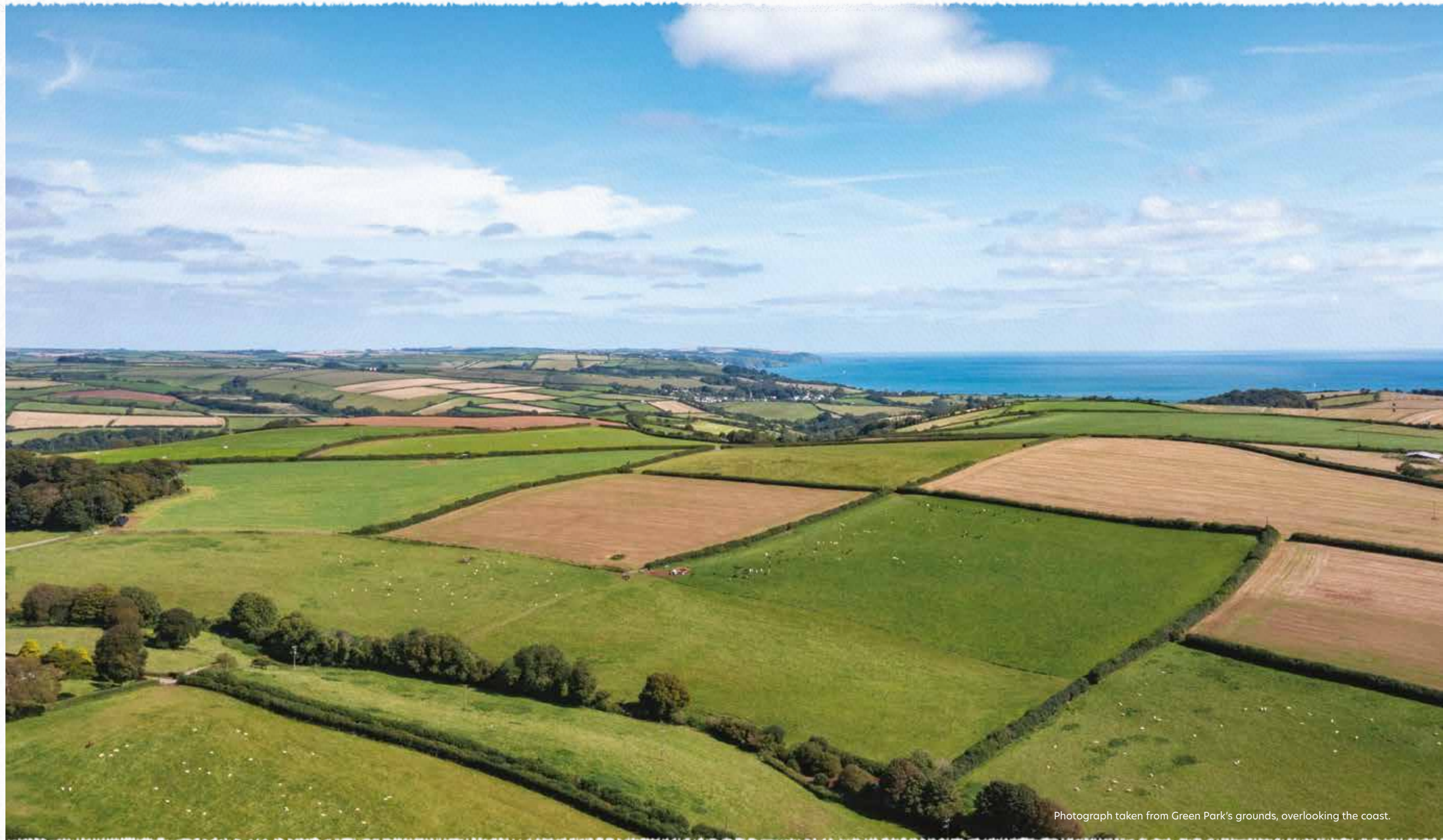
Photograph taken from Green Park's grounds, overlooking the coast.

In every direction, the countryside beckons, offering endless opportunities for discovery. From tranquil strolls through rolling fields to exhilarating adventures in the heart of nature, Green Park is your gateway to the boundless wonders of the countryside.