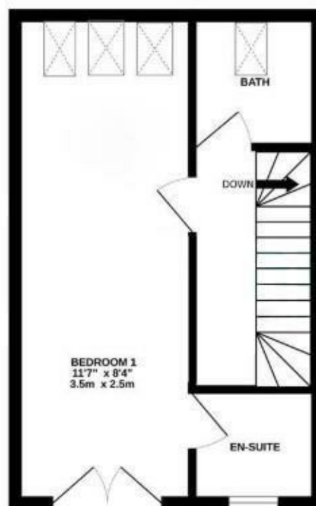
1ST FLOOR 307 sq.ft. (28.5 sq.m.) approx.