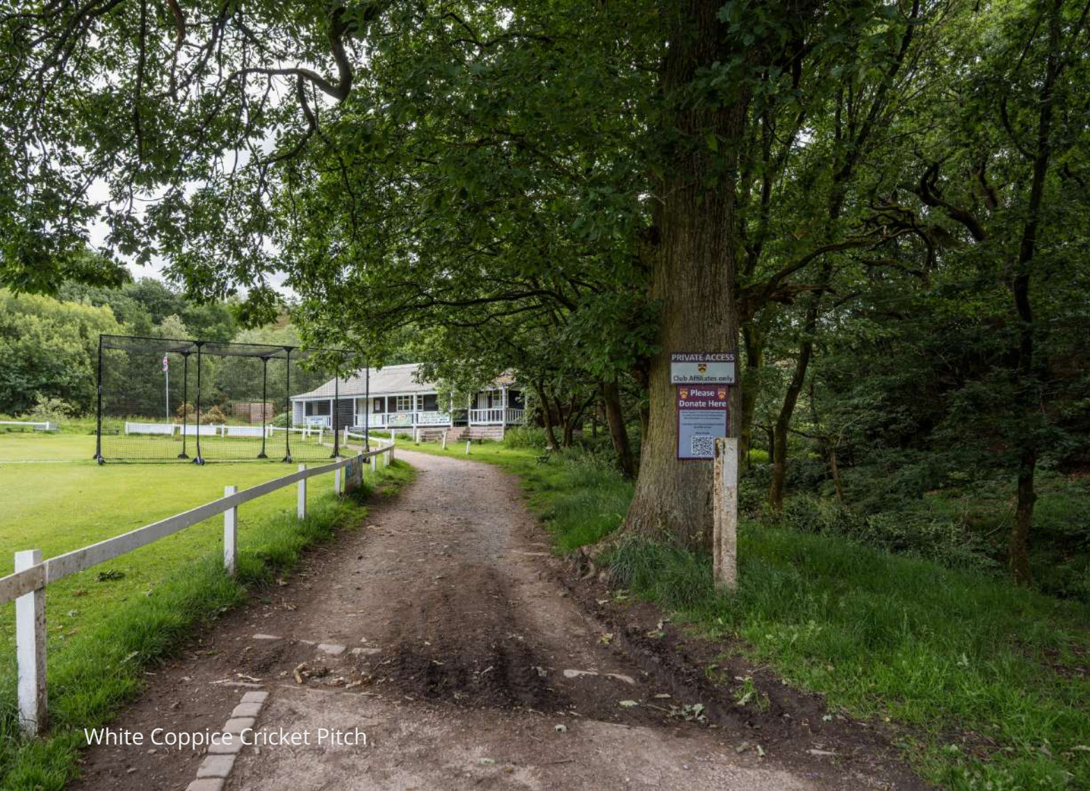
White Coppice Cricket Pitch