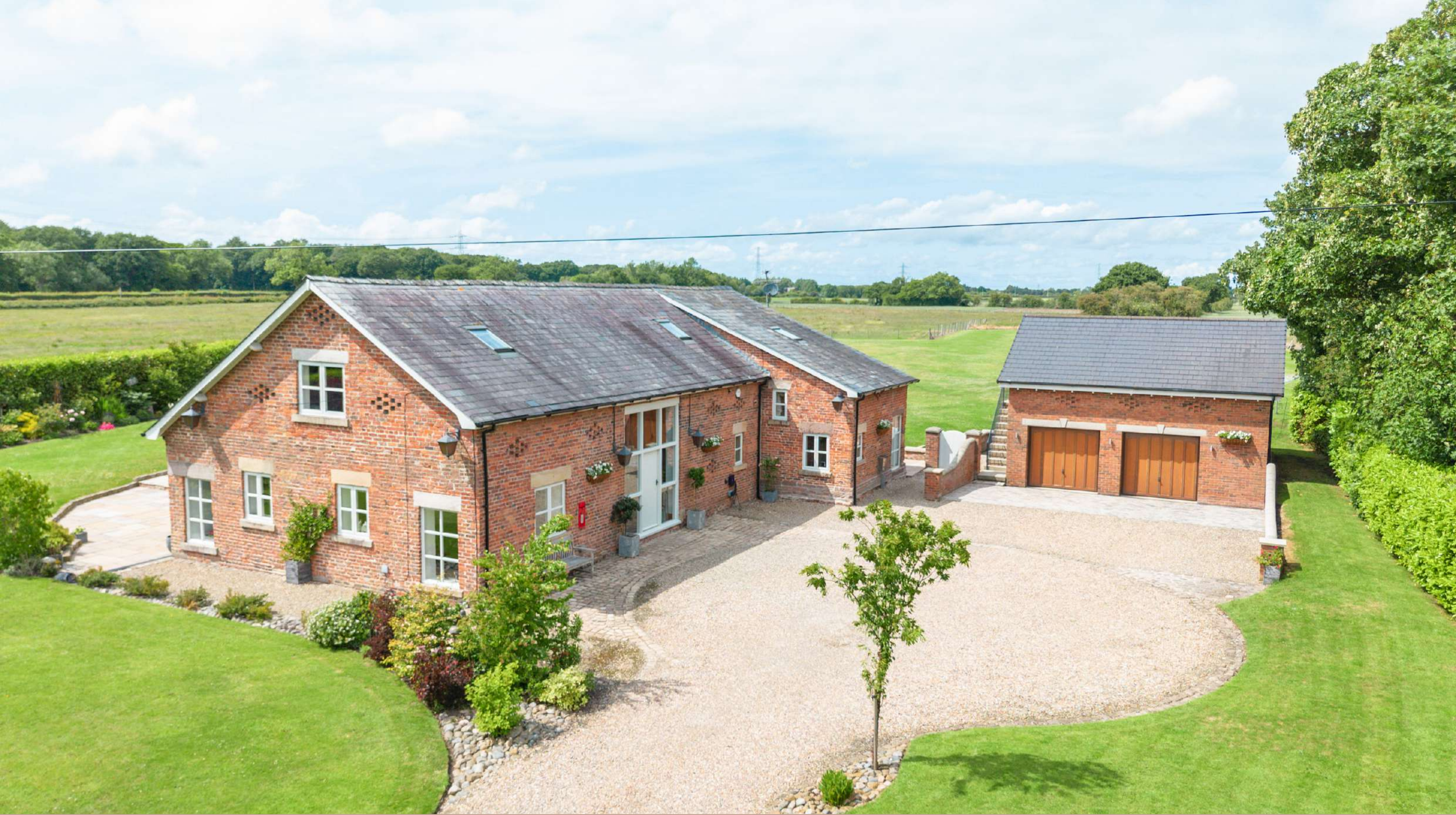
Brook House Barn, North Road, Bretherton