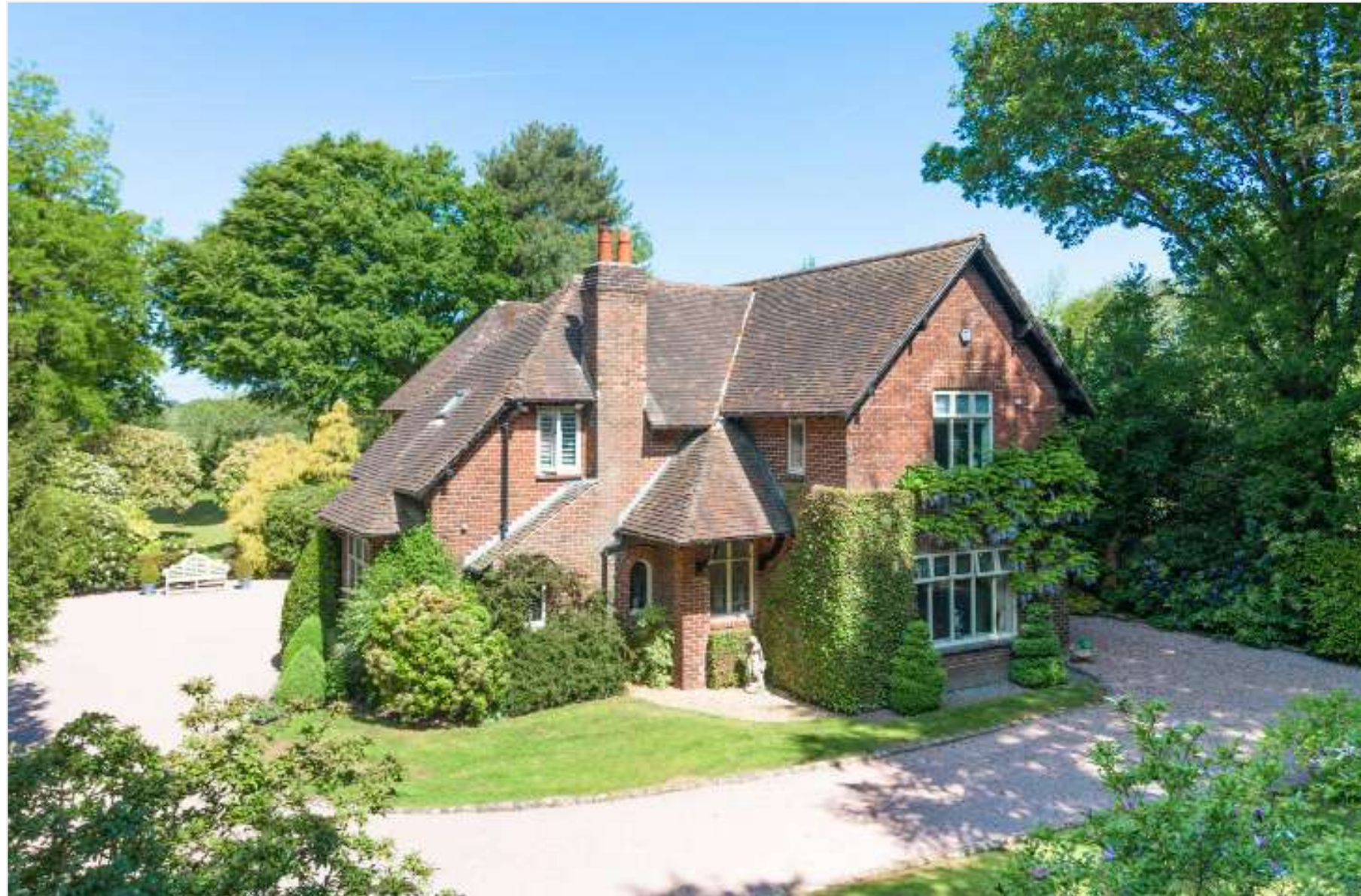
The Spinney, Cranes Lane, Lathom.