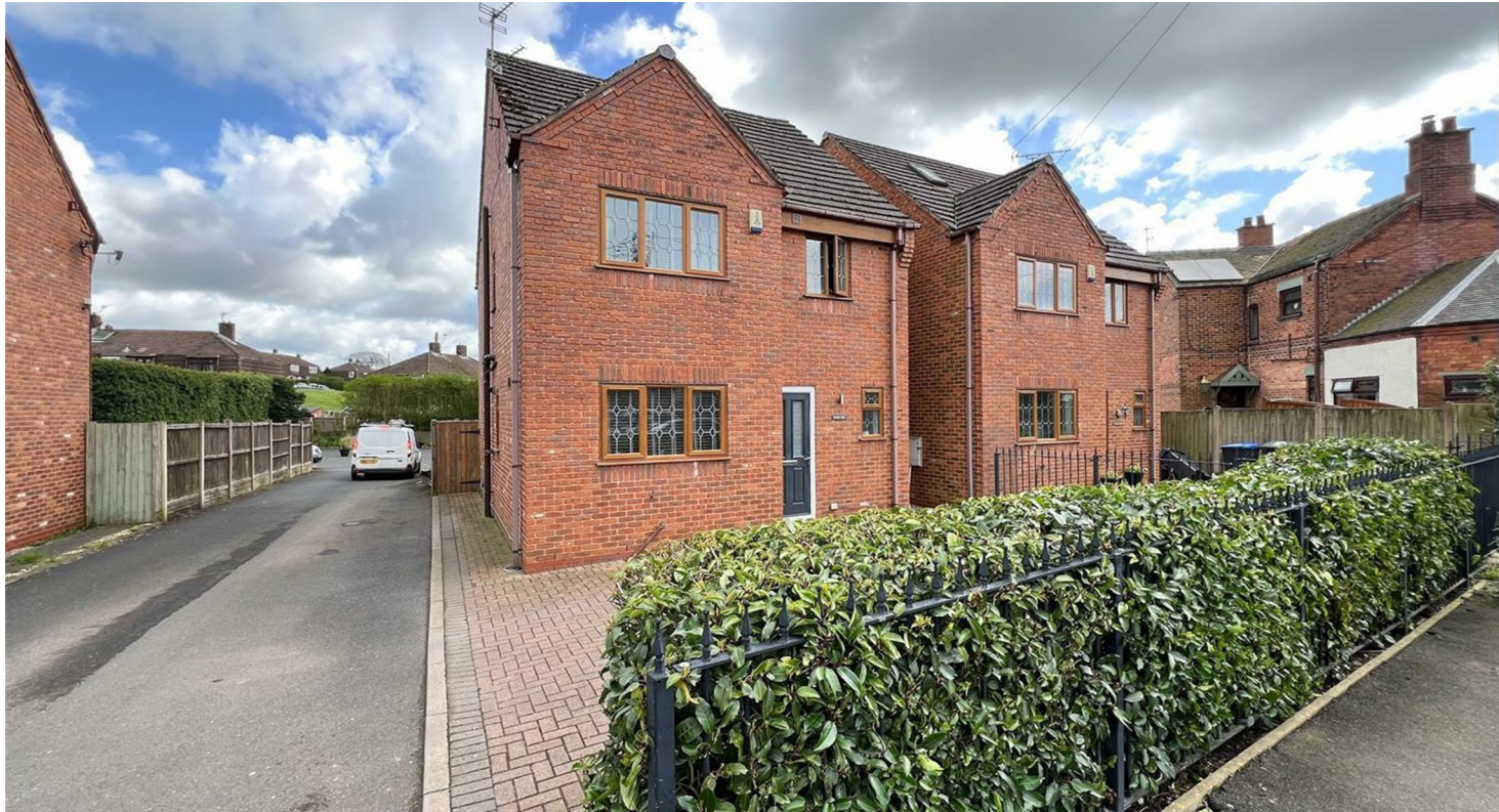
Sandy Well Sandy Lane, Brown Edge, Stoke-On-Trent, Staffordshire, £1,500 PCM