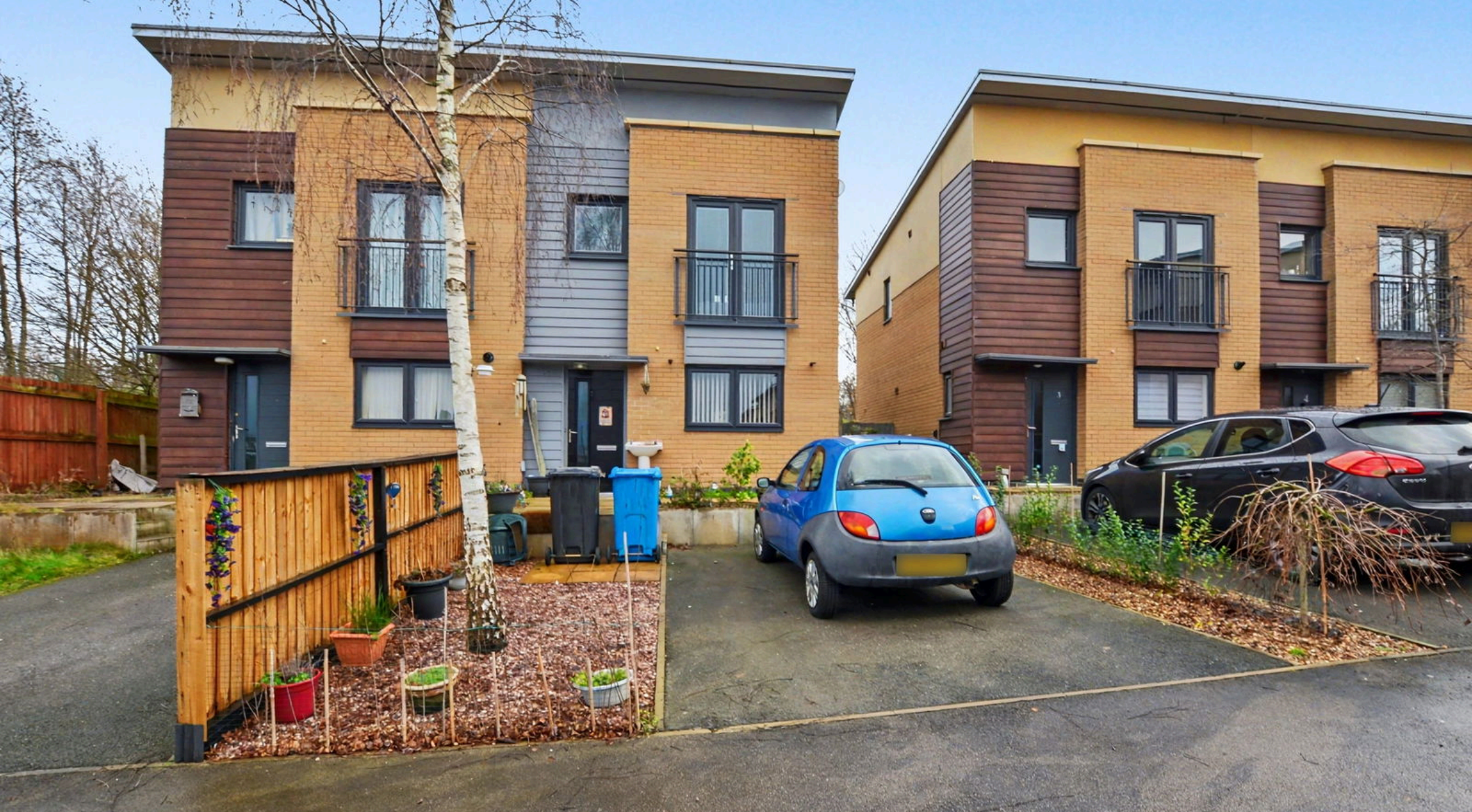
Northridge Mews, Runcorn