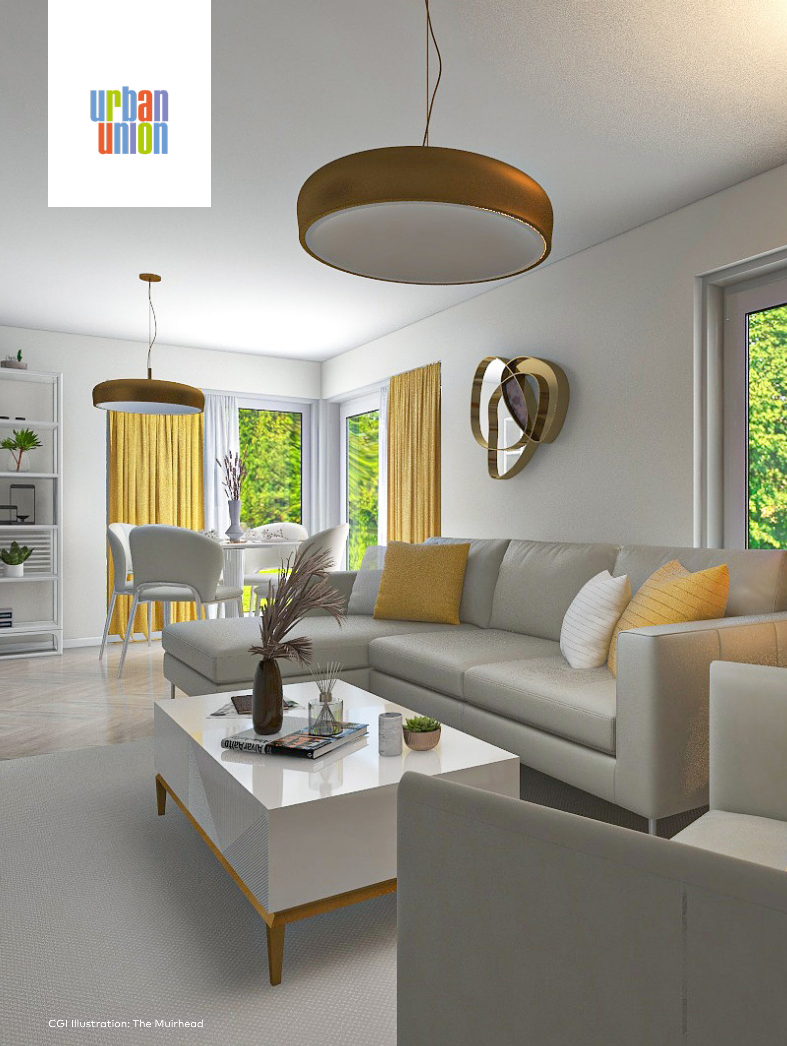
CGI Illustration: The Muirhead