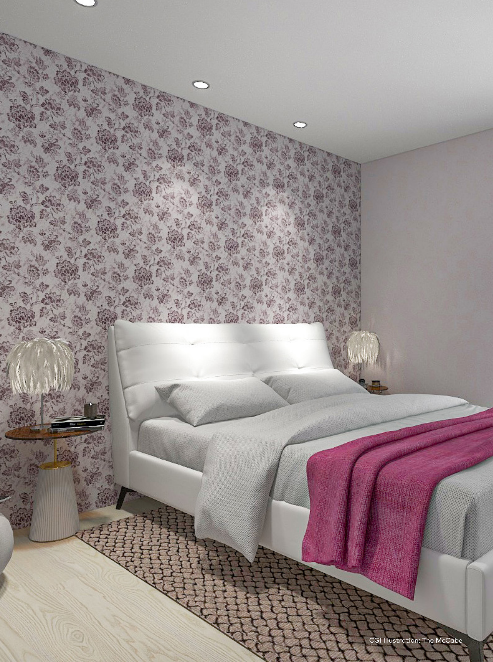
CGI Illustration: The McCabe