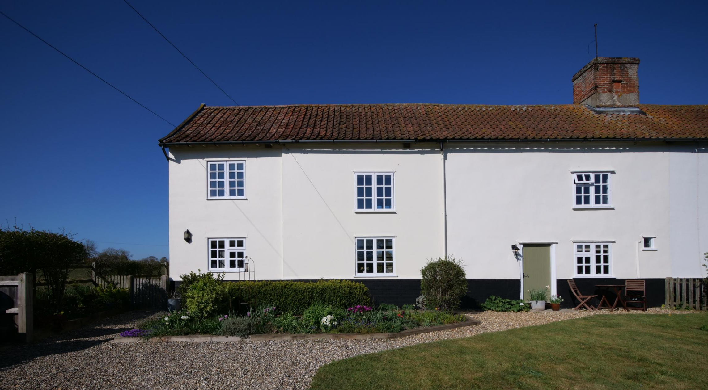
Walnut Tree Cottage, Brandeston, Suffolk