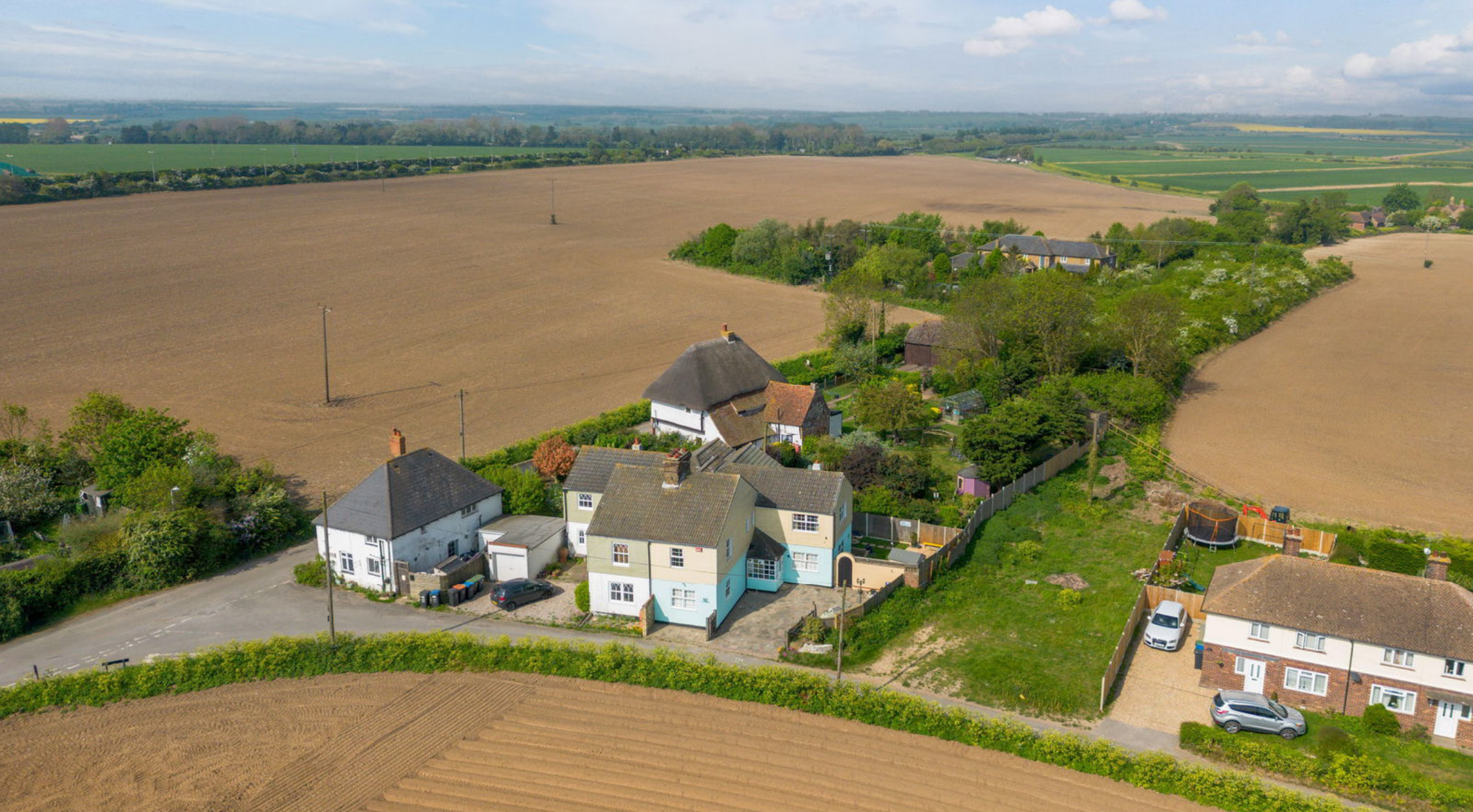
Holly Tree Cottage, Potten Street, St. Nicholas At Wade