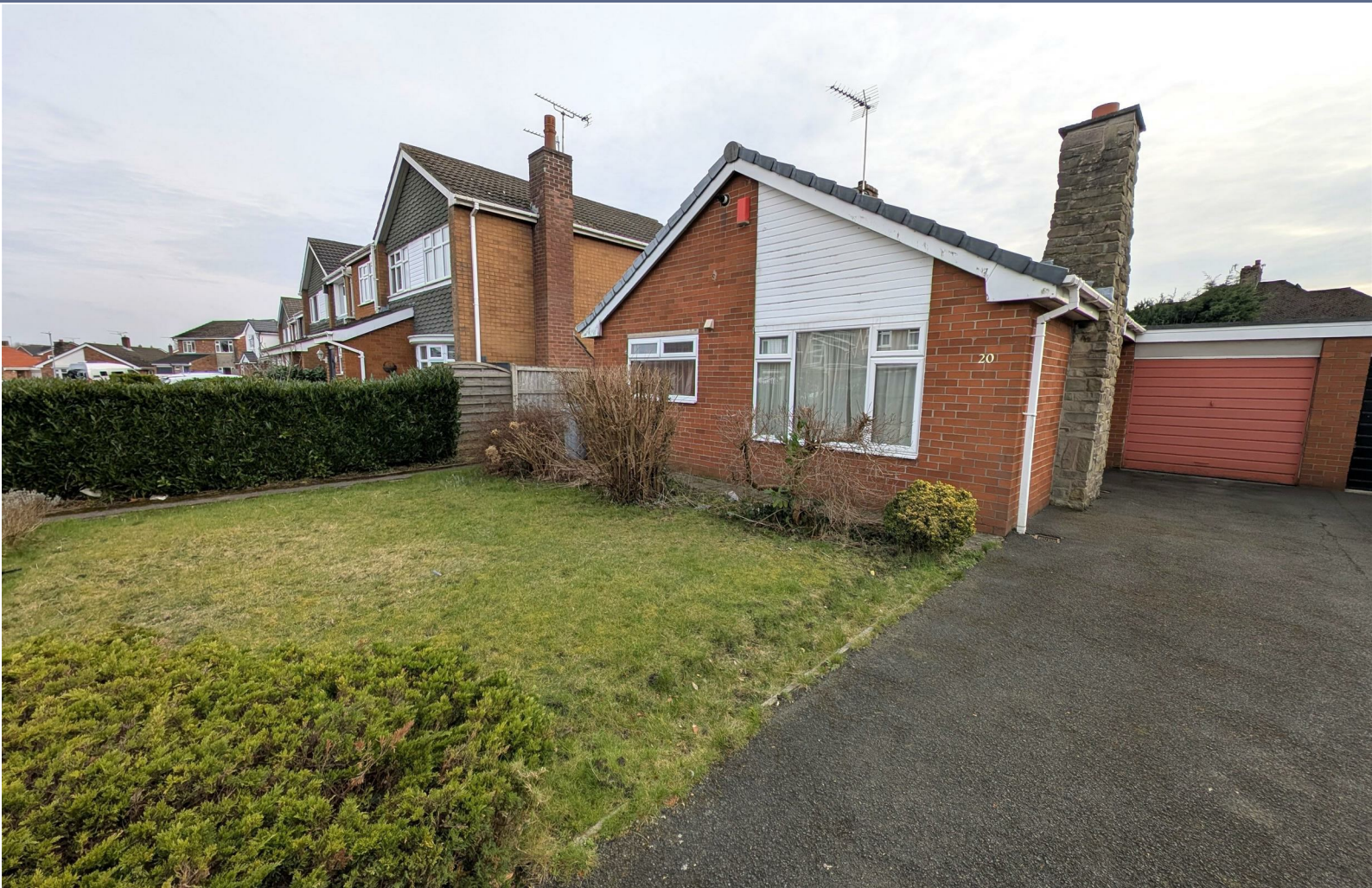
Riverside Crescent Crewe