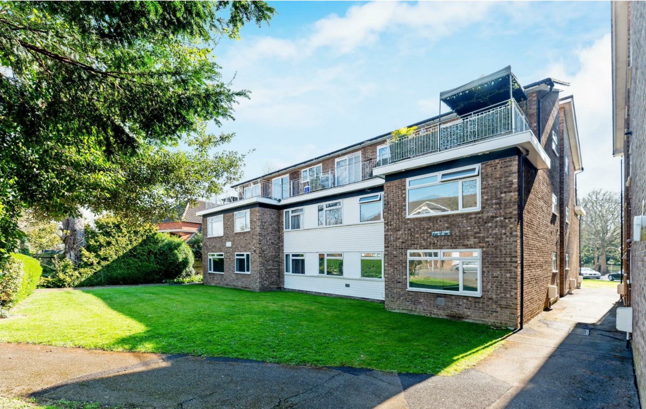
Purdey Court, The Avenue, Worcester Park