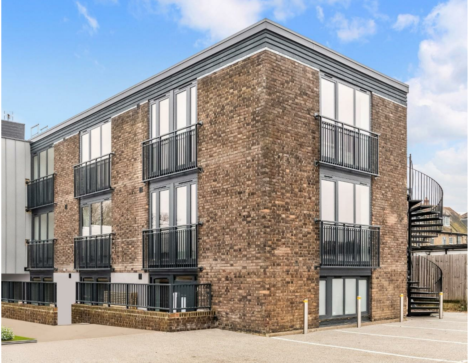
Tealing Court, Ewell