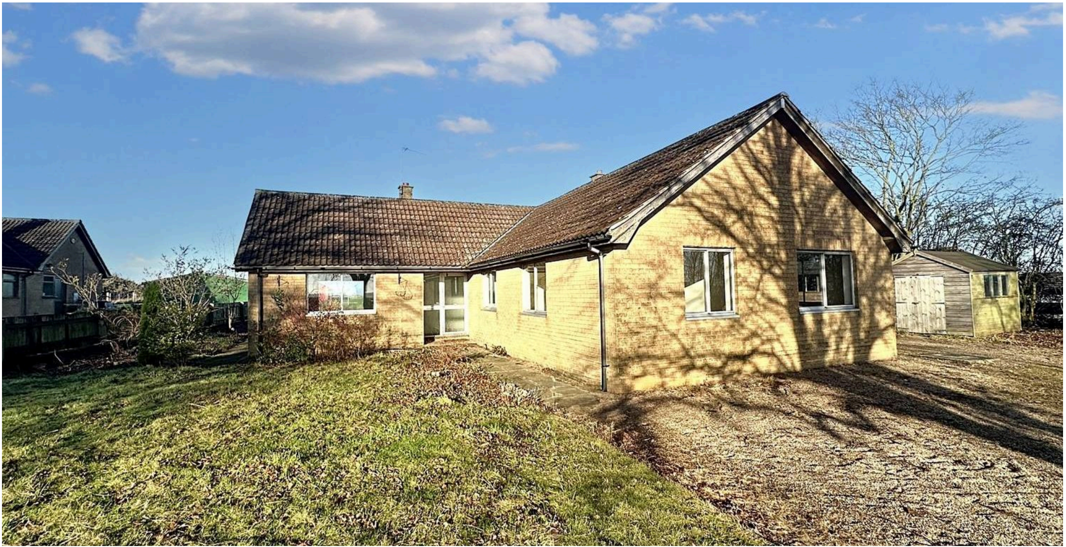
Suffolk Cottage Gorse Lane, Grantham Grantham