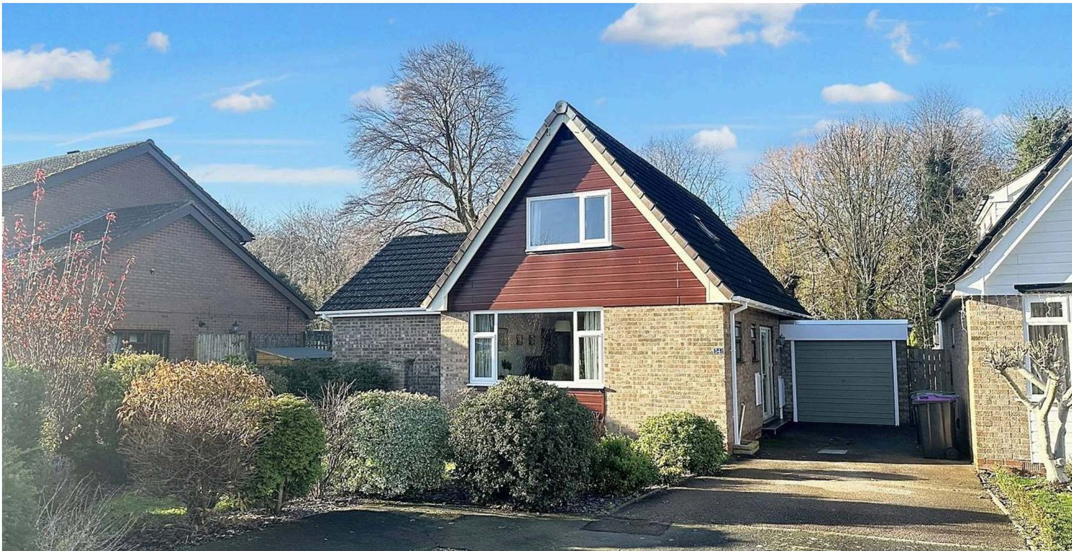
34 Cottesmore Close, Grantham Grantham