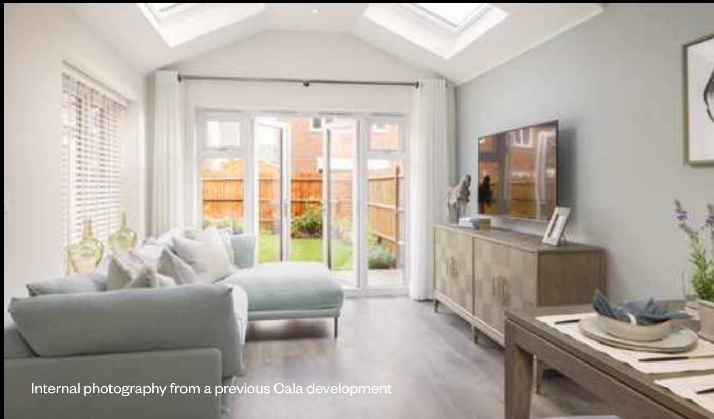
Internal photography from a previous Cala development

“We wanted a new build. Our previous house needed substantial work doing over the time we were living there and always felt like an ongoing process, so we wanted to leave that behind and find somewhere new, homely and ready.