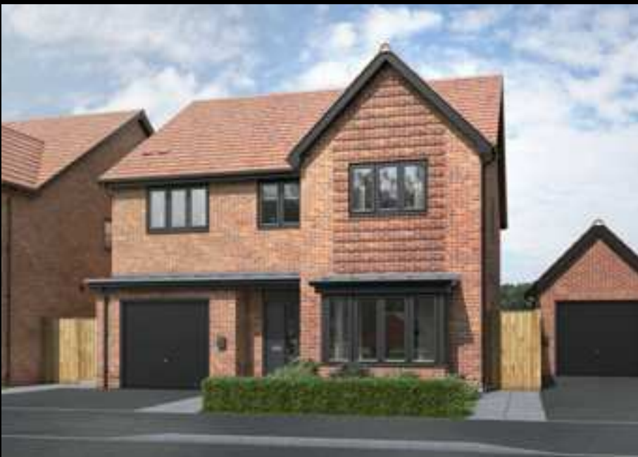
The Wintergreen 4 bedroom detached home