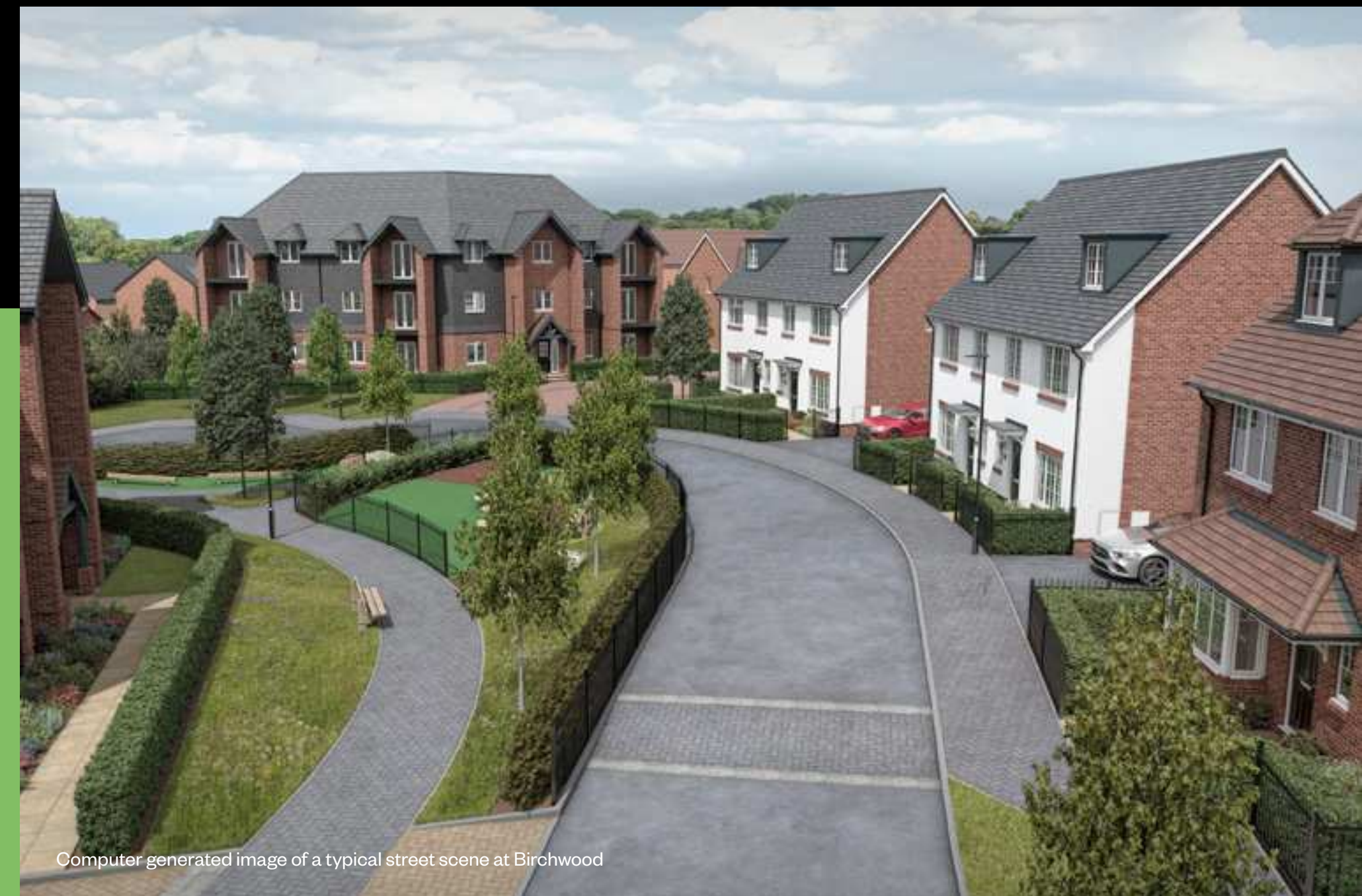
Computer generated image of a typical street scene at Birchwood