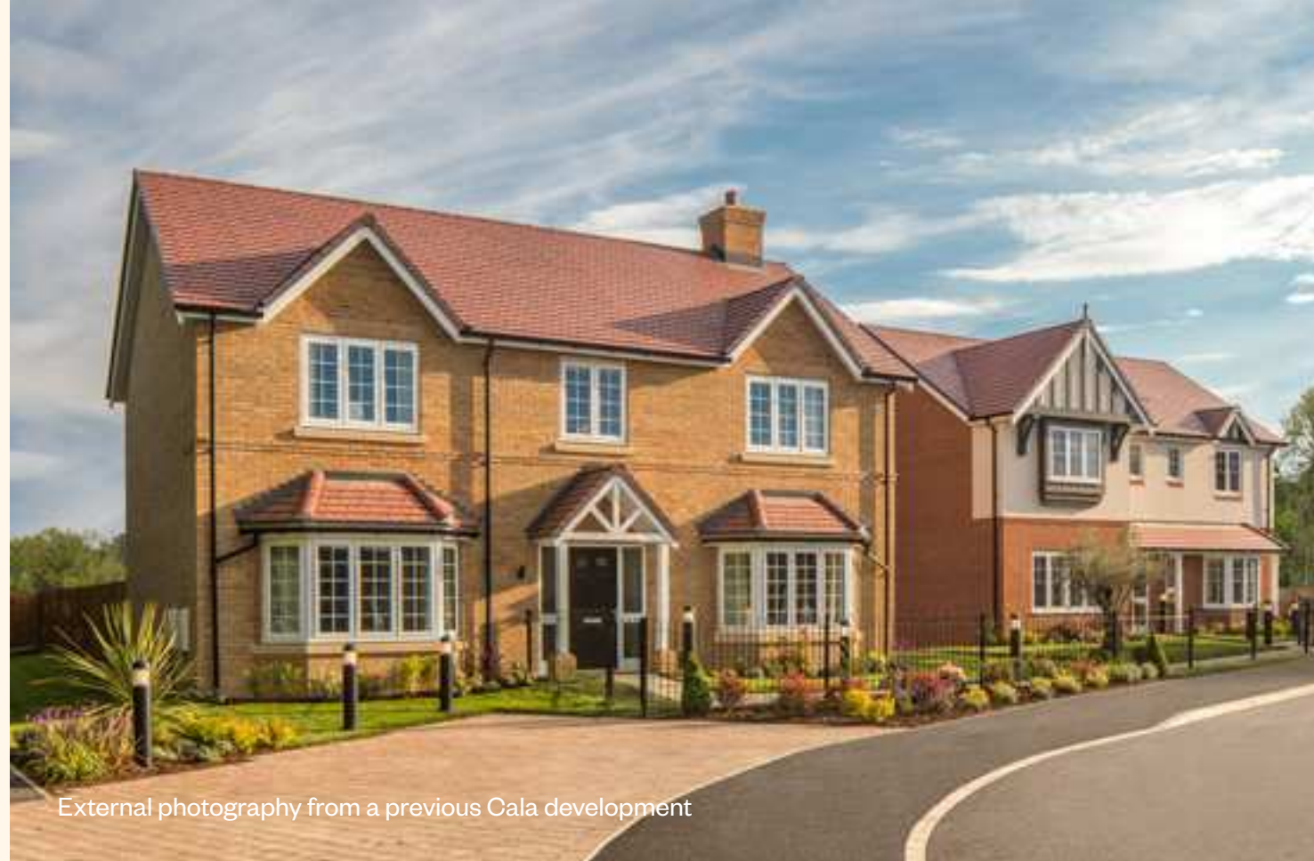
External photography from a previous Cala development