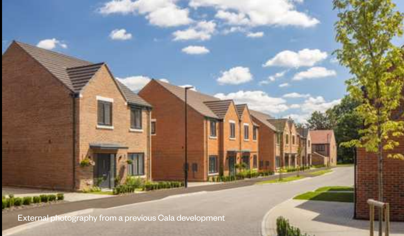
External photography from a previous Cala development