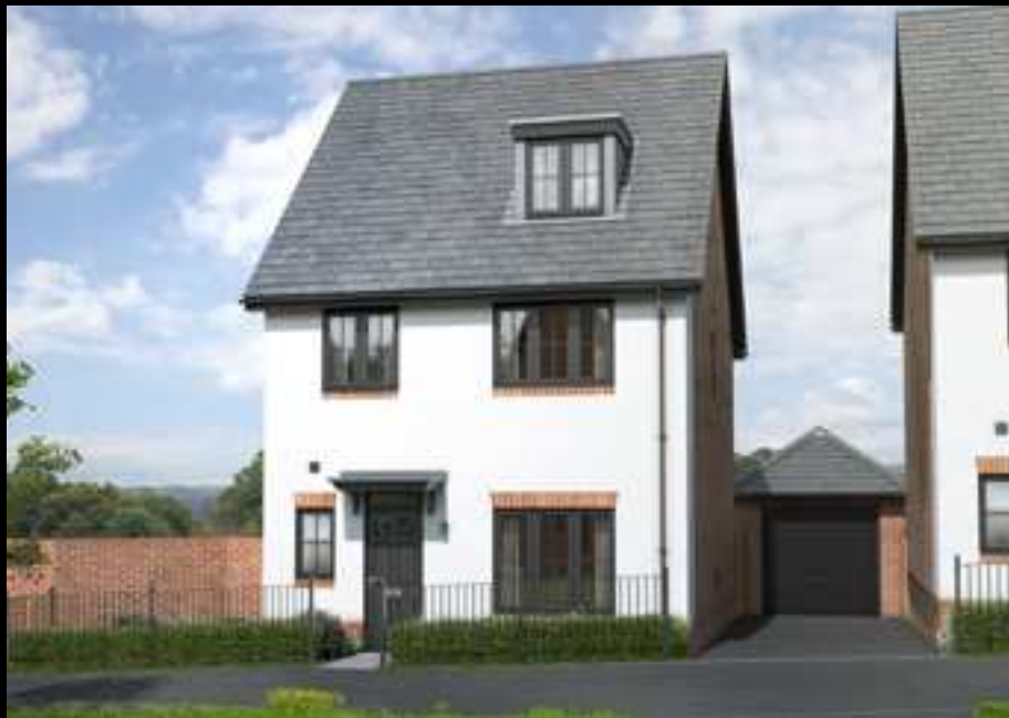
The Lancewood 3 bedroom detached home