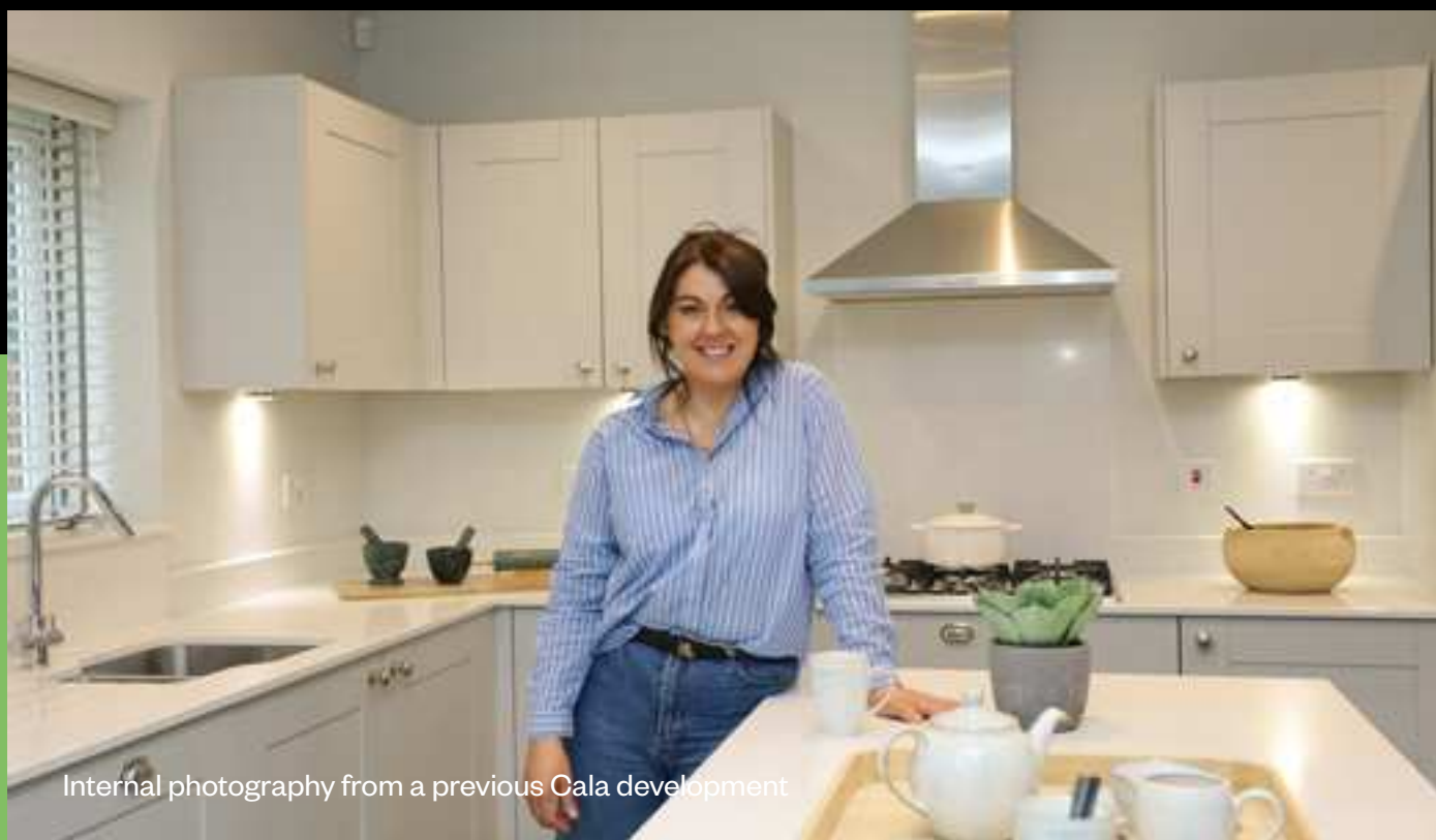
Internal photography from a previous Cala development

The Staceyfounds, Purchasers at St Peter's Quarter