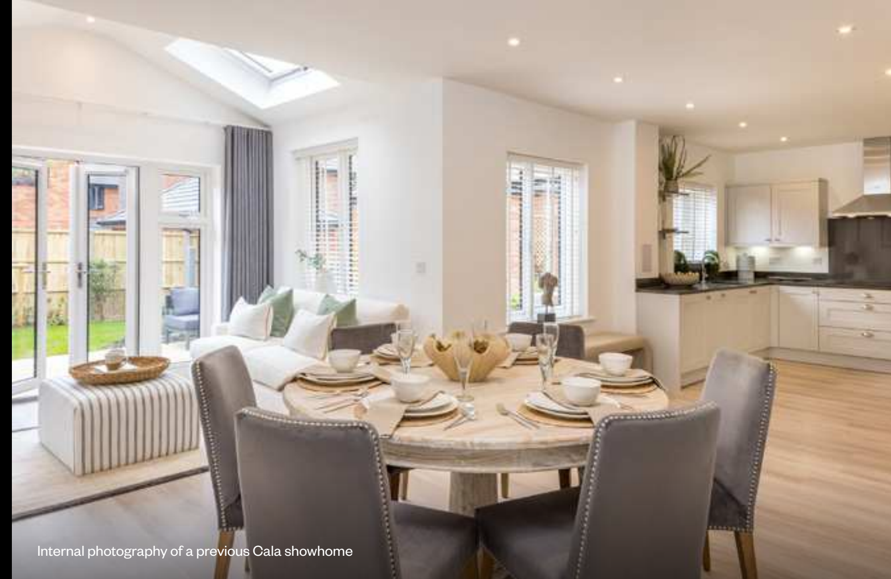
Internal photograph of a previous Cala showhome

At Birchwood, you'll find a range of beautifully designed homes, with timber frame structures and spacious interiors. Each home boasts stylish fittings and quality specifications, all crafted with a focus on sustainability. The elegant exteriors are thoughtfully enhanced with nature-friendly features, while the open-plan, flexible living spaces are designed to effortlessly adapt to your evolving needs. You can also expect energy efficiency as standard, with these Light and Space range, timber frame structured homes fitted with Daikin air source heat pumps and EV car charging points.