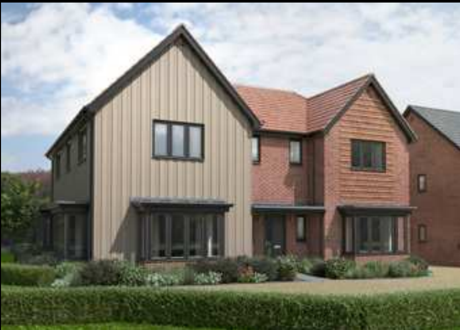
The Yew 5 bedroom detached home

Click here for current availability and prices >