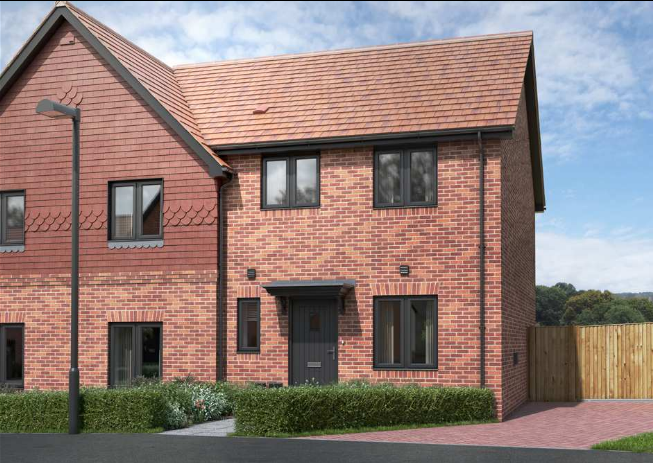
The Bayberry 2 bedroom semi-detached home