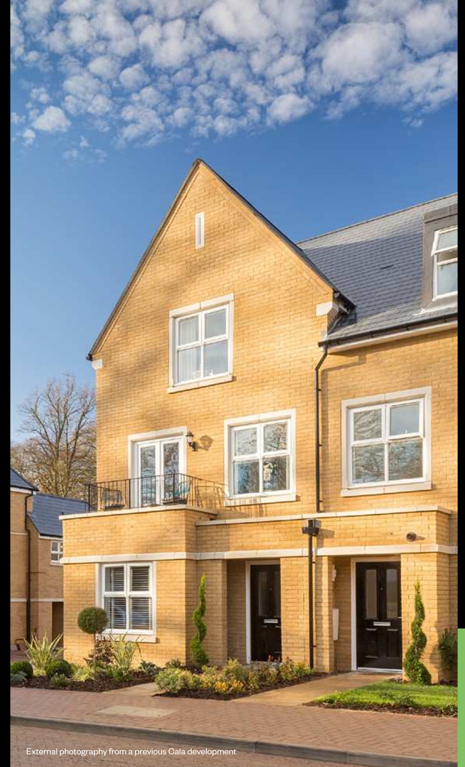
External photography from a previous Cala development