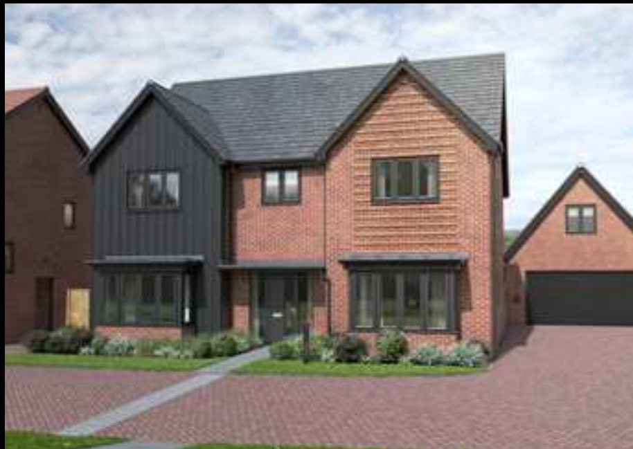
The Willow 5 bedroom detached home