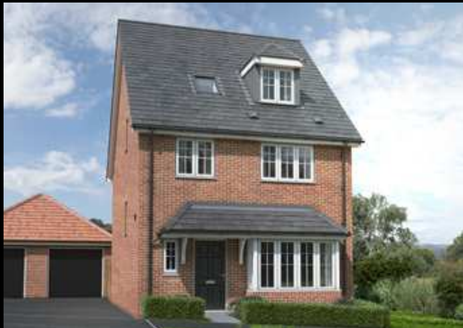
The Pine 3 bedroom detached home