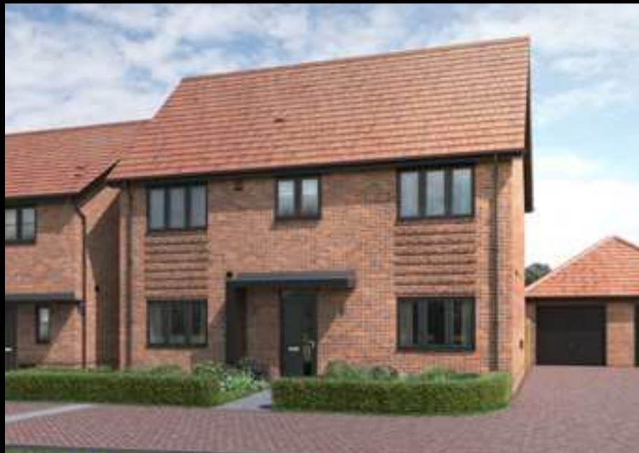
The Marram 3 bedroom detached home