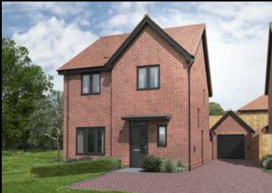
The Orpine 3 bedroom detached home

Click here for current availability and prices