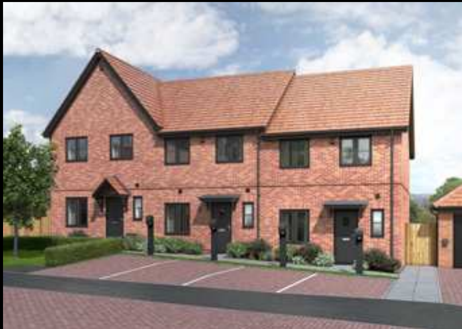
The Beech 2 bedroom semi-detached or terraced home