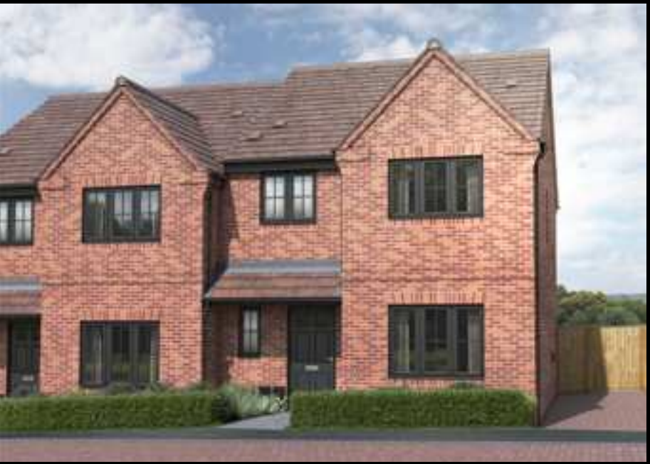
The Fennel 3 bedroom detached or semi-detached home

Click here for current availability and prices >