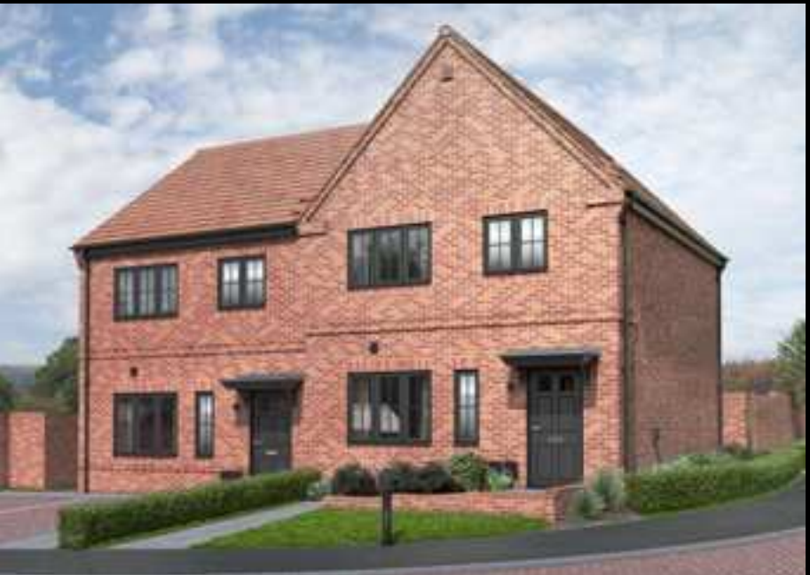
The Brome 3 bedroom semi-detached home