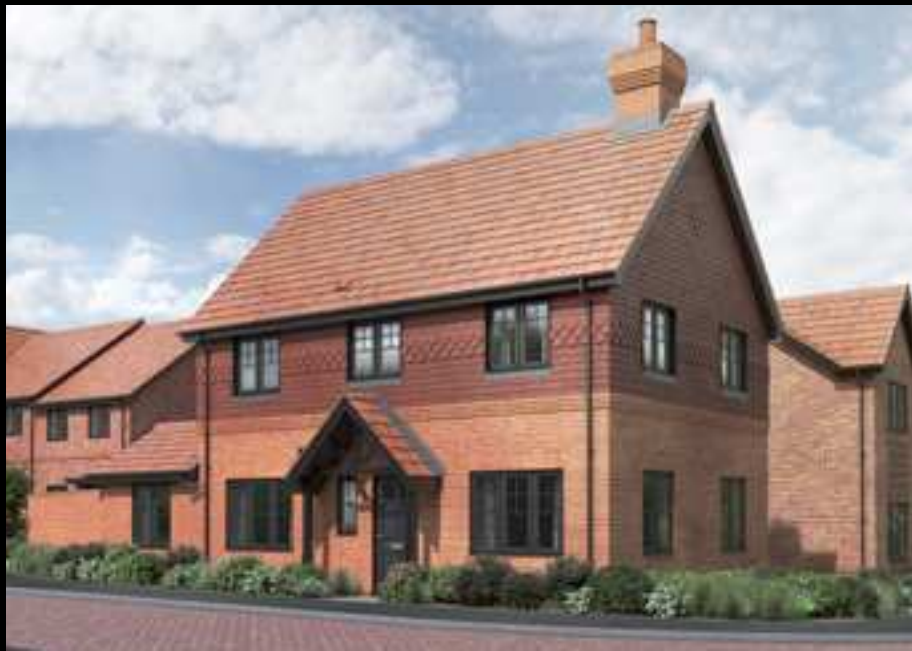
The Dandelion 3 bedroom detached or semi-detached home