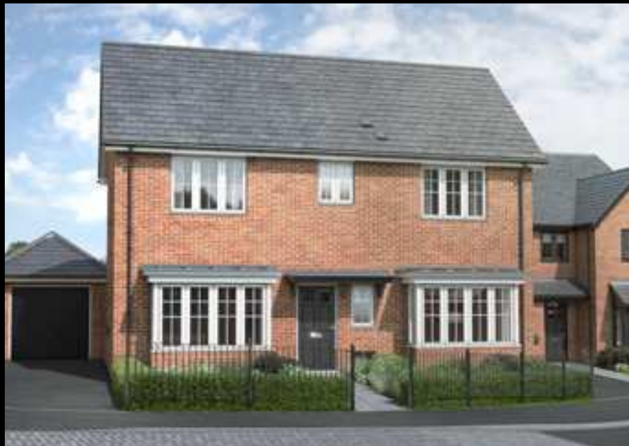
The Silverbell 4 bedroom detached home