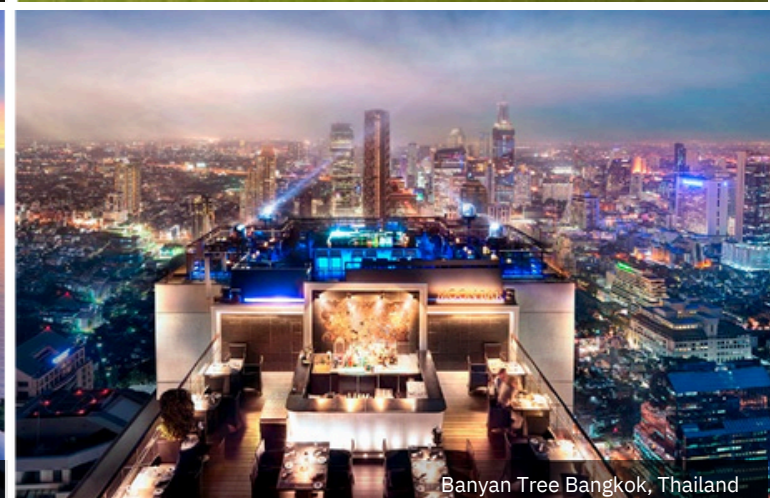
Banyan Tree Bangkok, Thailand