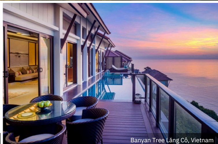
Banyan Tree Lăng Cô, Vietnam