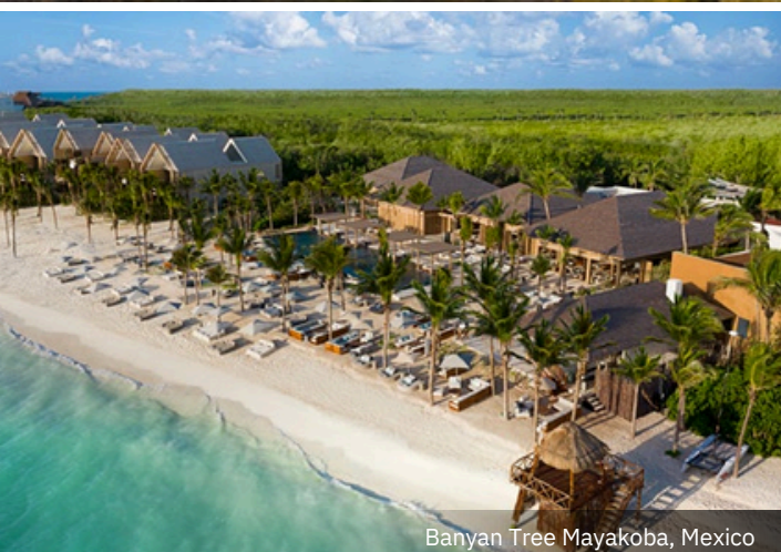
Banyan Tree Mayakoba, Mexico