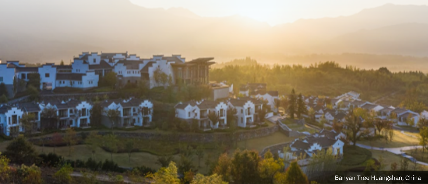
Banyan Tree Huangshan, China

Our Group prides itself on the dedicated management of its properties, along with a generous array of services and amenities committed to nothing short of excellence. A 24-hour concierge is readily available to homeowners, and a professional team will always be on hand to assist in maintenance and rental services. Ensuring top-tier administration and supervision of homes all year-round.