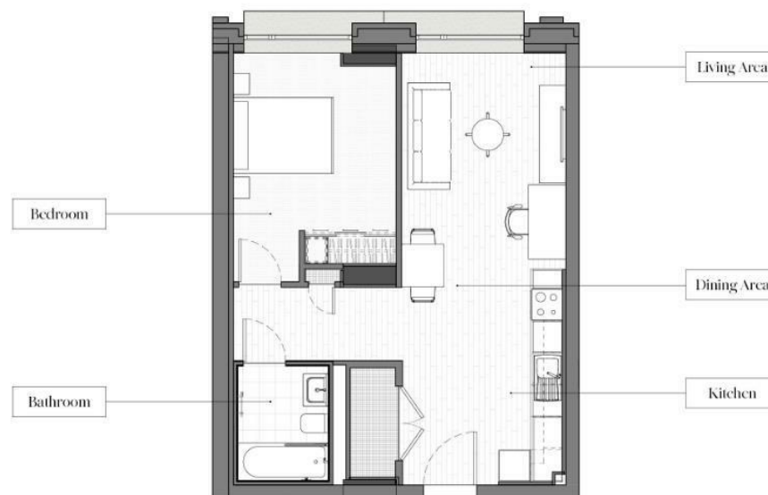
Park Residence — One Bed Type 2

Agents Note: Whilst every care has been taken to prepare these particulars, they are for guidance purposes only. All measurements are approximate and are for general guidance purposes only and whilst every care has been taken to ensure their accuracy, they should not be relied upon and potential buyers are advised to recheck the measurements.