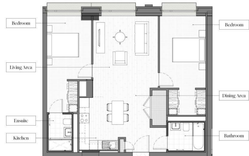
Park Residence — Two Bed Type 4

Agents Note: Whilst every care has been taken to prepare these particulars, they are for guidance purposes only. All measurements are approximate and are for general guidance purposes only and whilst every care has been taken to ensure their accuracy, they should not be relied upon and potential buyers are advised to recheck the measurements.