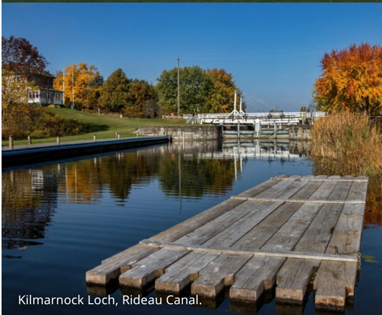
Kilmarnock Loch, Rideau Canal.