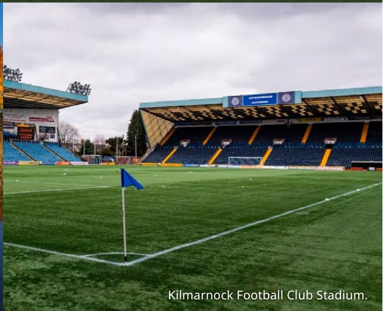
Kilmarnock Football Club Stadium.