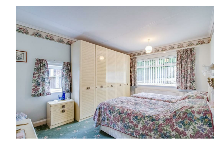
BEDROOM TWO 10'8" x 9'11" (3.26m x 3.03m)

UPVC double glazed windows to the side and rear, coving to the ceiling and central heating radiator.