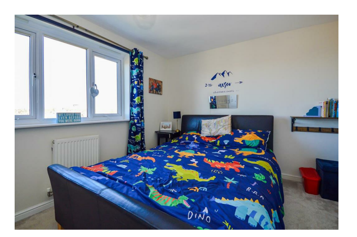
BEDROOM THREE 13'5" x 8'10" (max) (4.1m x 2.7m (max)) Two windows to the front and central heating radiator.

Window overlooking the back garden and full width range of fitted wardrobes.