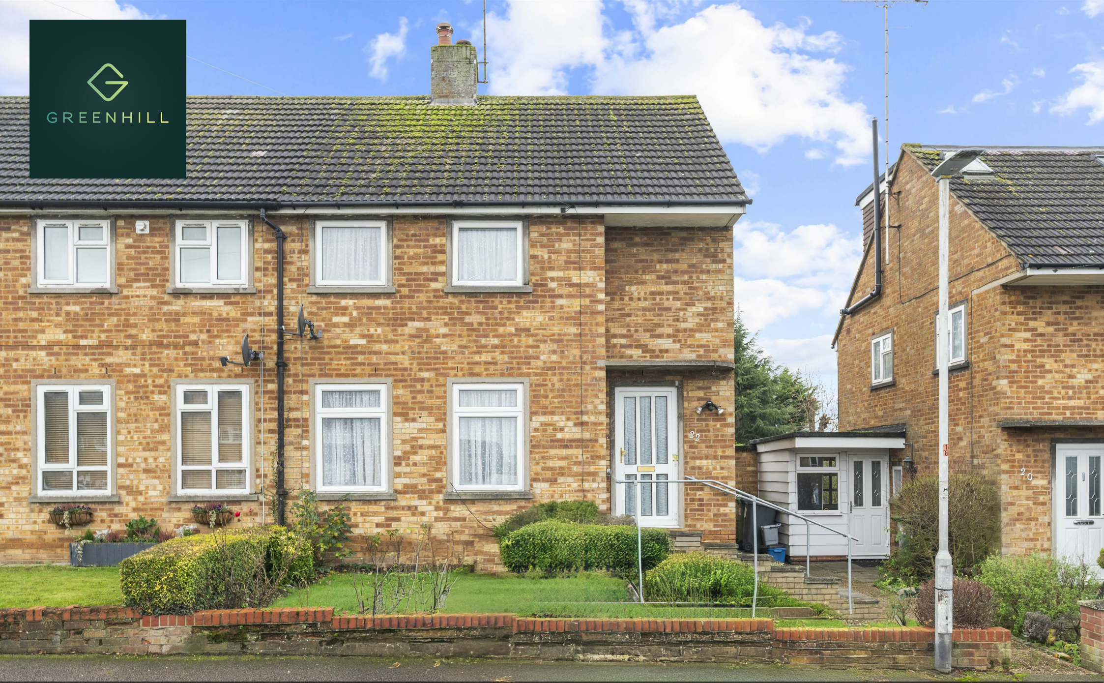
Brookside South Mimms, Potters Bar, EN6 3PU Guide price £550,000