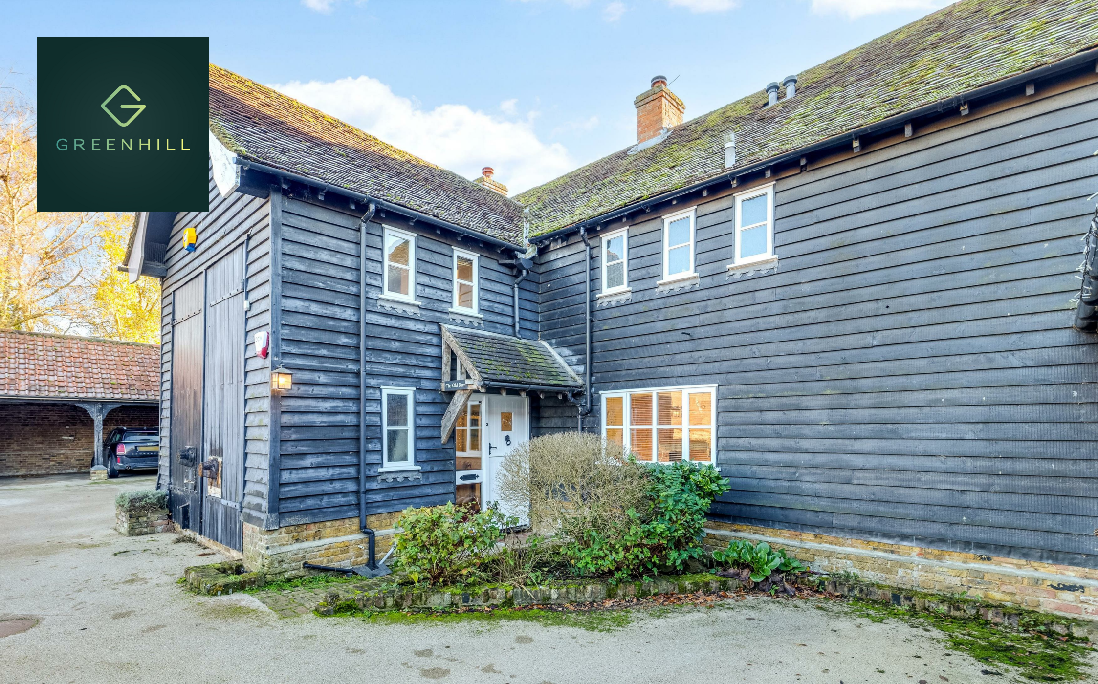
Green Man Court, Eastwick, CM20 2QP Guide price £850,000