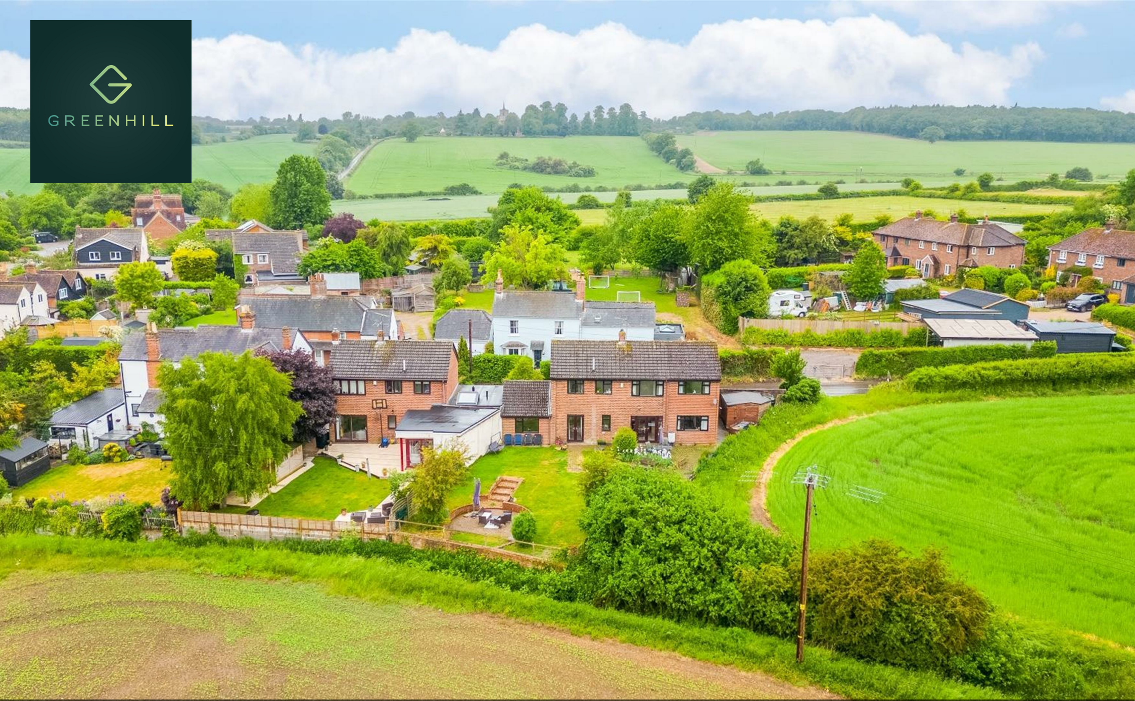
Bourne House Clapgate Albury, Ware, SG11 2JS Guide price £685,000