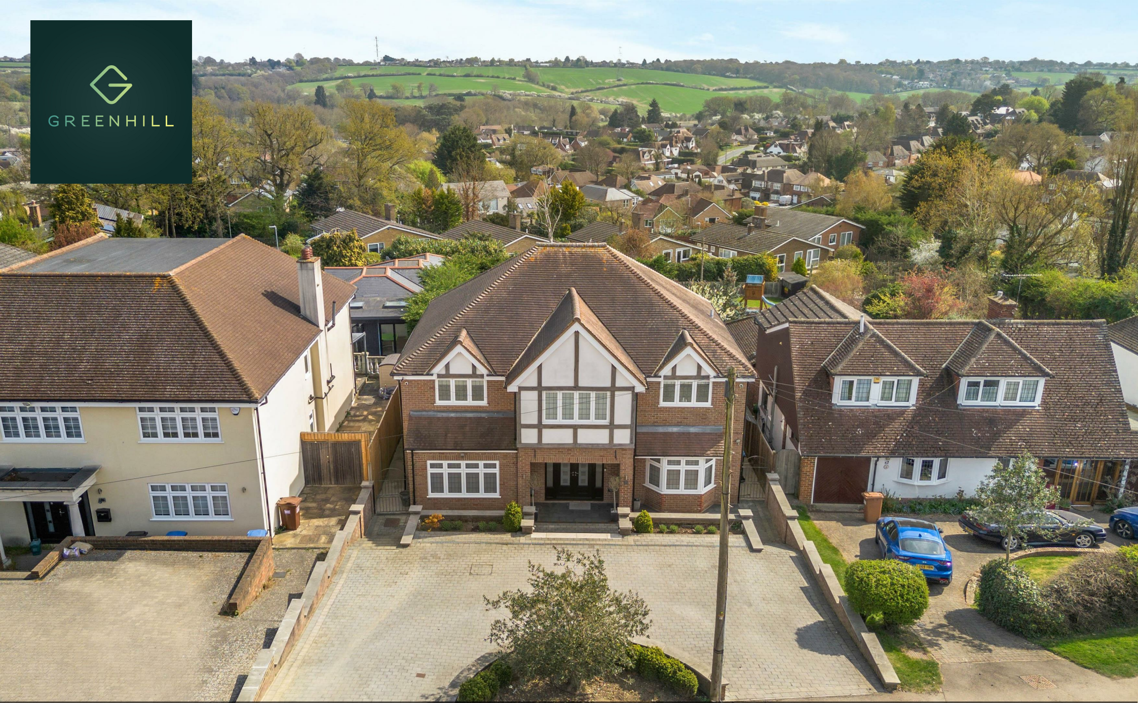
44 Hill Rise Cuffley, Potters Bar, EN6 4EJ Offers in excess of £1,250,000