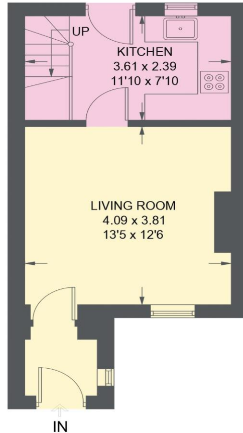
GROUND FLOOR 27.6 SQ M / 297 SQ FT

APPROXIMATE GROSS INTERNAL AREA = 52.2 SQ M / 562 SQ FT