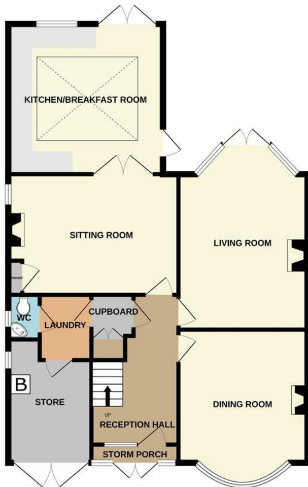
GROUND FLOOR 992 sq.ft. (92.2 sq.m.) approx.