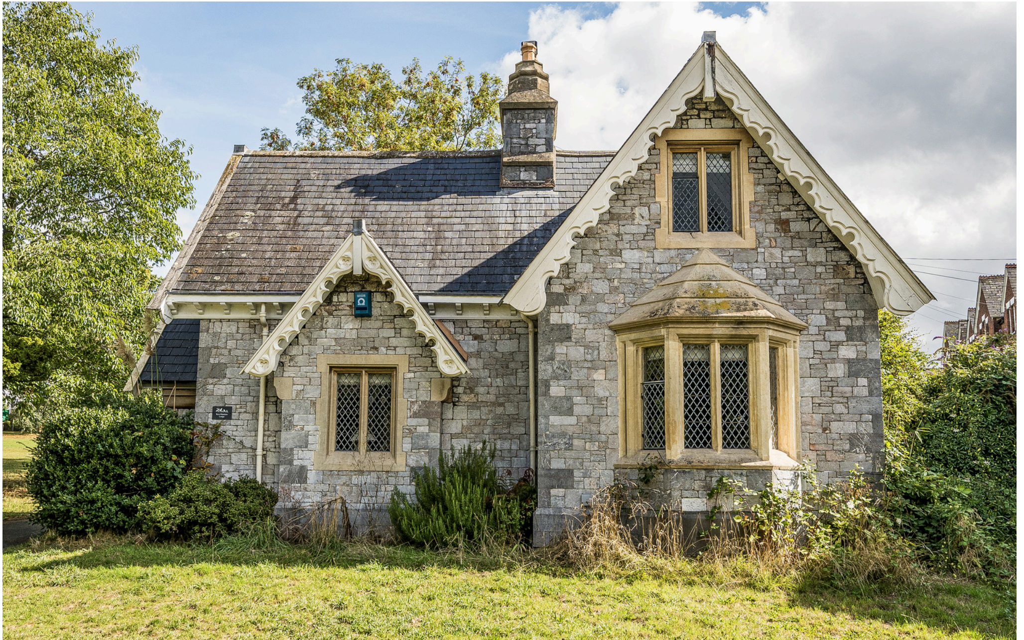
Bury Meadow Lodge New North Road | Exeter | Devon | EX4 4HH