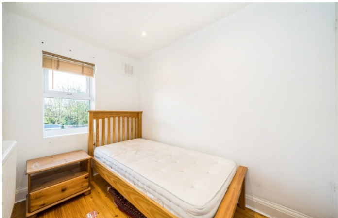
Boston Road, CR0