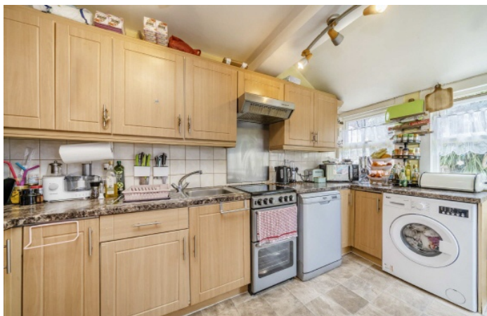
Winterbourne Road, CR7