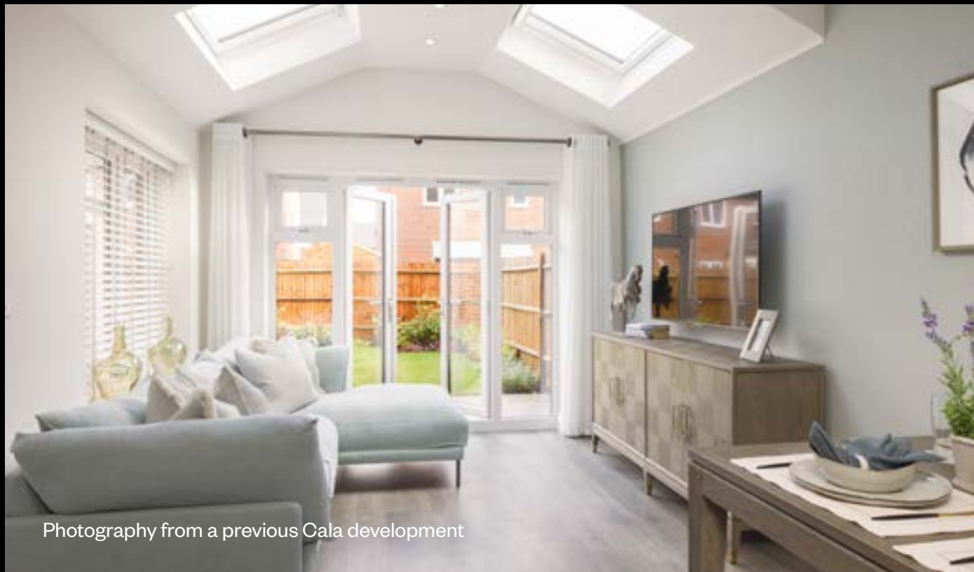
Photography from a previous Cala development