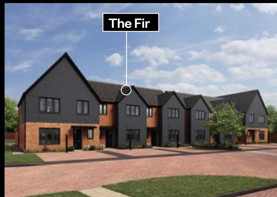
The Fir 3 bedroom mid and end- terraced home