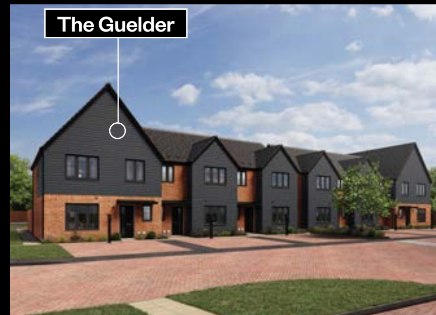
The Guelder 4 bedroom end-terraced home