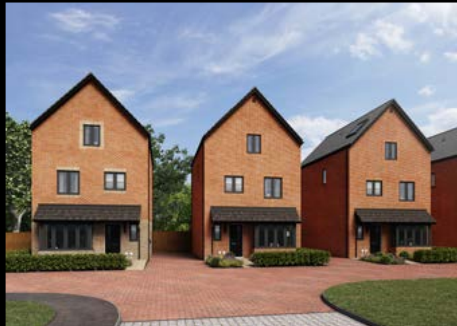
The Mulberry 4 bedroom detached and semi-detached home