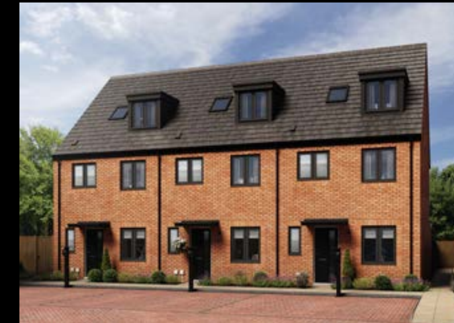
The Foxglove 3 bedroom terraced home