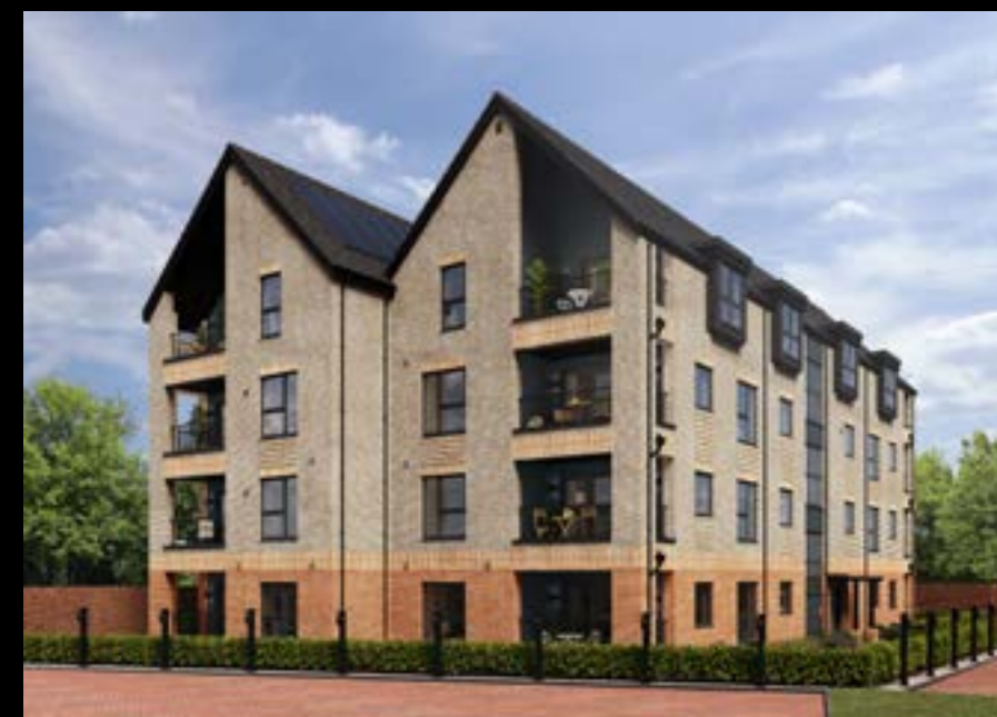
Farmhouse Apartments 1 & 2 bedroom apartments 1 bedroom First Homes

Click here for current availability and prices