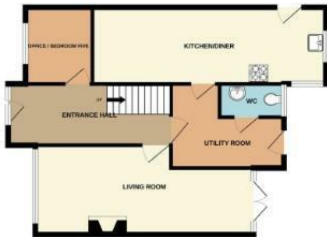
GROUND FLOOR 643 sq.ft. (59.8 sq.m.) approx.