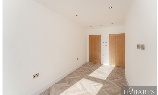
Flat 2, 31 Dagmar Road, London, N4 4NY