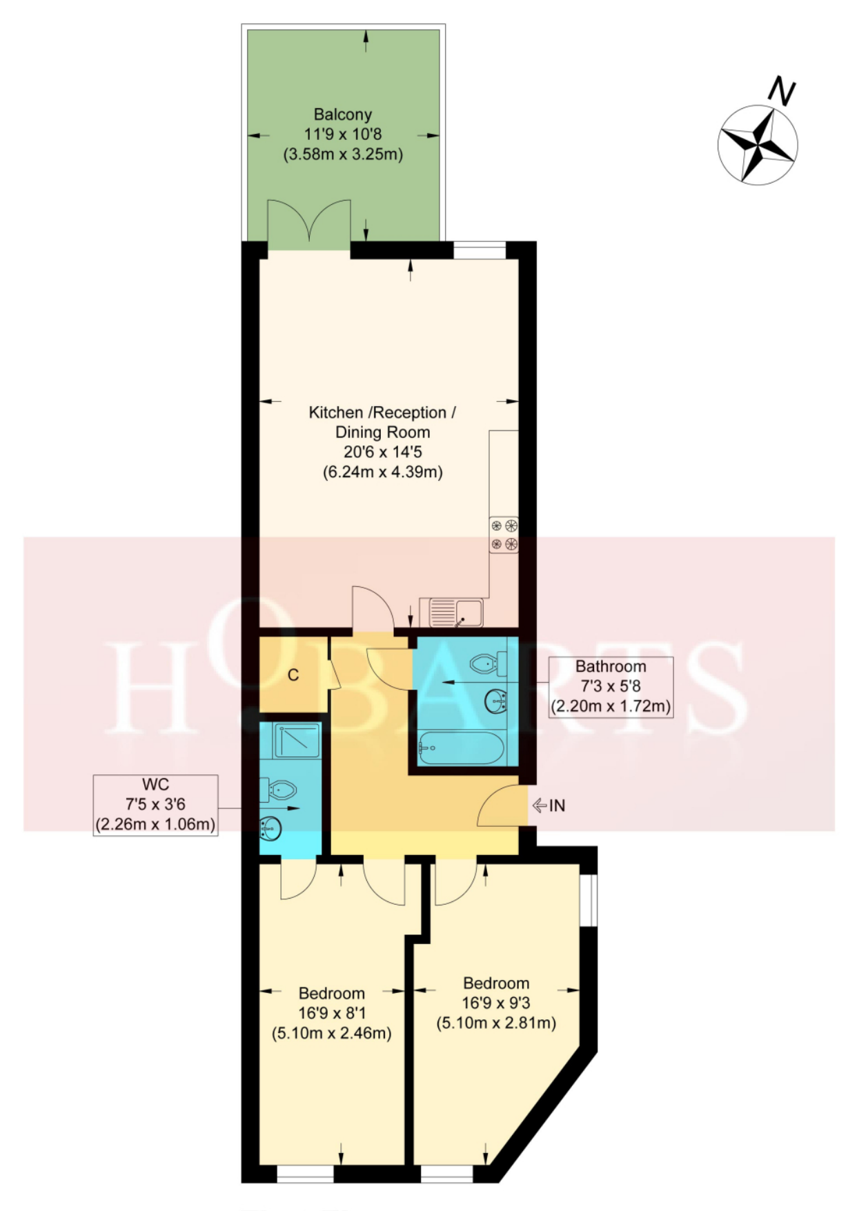
First Floor Dagmar Road

Approximate Gross Internal Floor Area: 70.80 sq m / 762.08 sq ft Illustration for identification purposes only, measurements are approximate, not to scale.