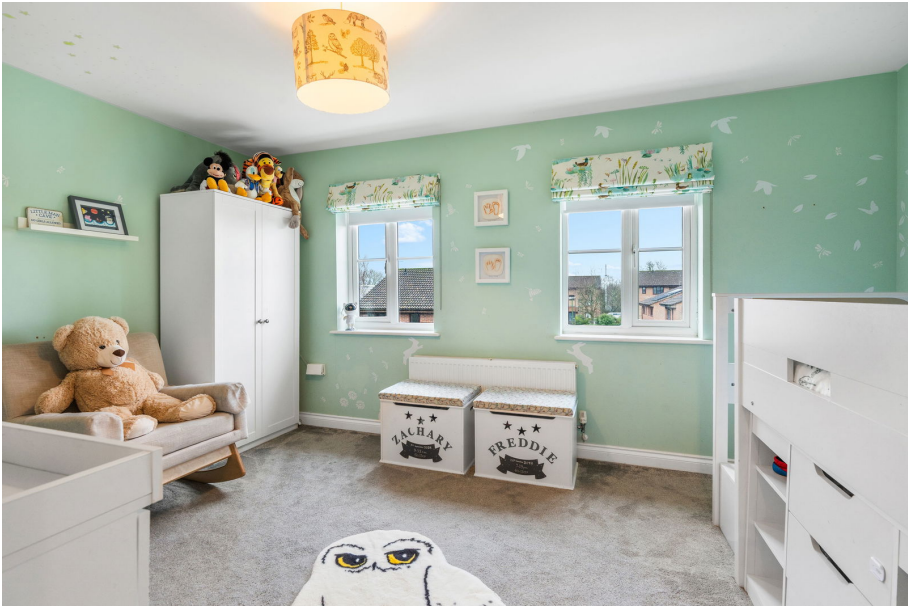
Mulberry Gardens, Horsham, RH12 3NH

Clickmymove.com are proud to present this exceptional three double bedroom townhouse, arranged over three floors, offering a top-of-the-range kitchen/diner with quartz worktops, a spacious open-plan lounge and dining area, an additional lounge, a separate utility room, a low-maintenance garden, a large family bathroom, and two modern en-suites. Additional features include a garage with conversion potential, driveway parking, and an electric car charging point, all set within the highly desirable Broadbridge Heath.