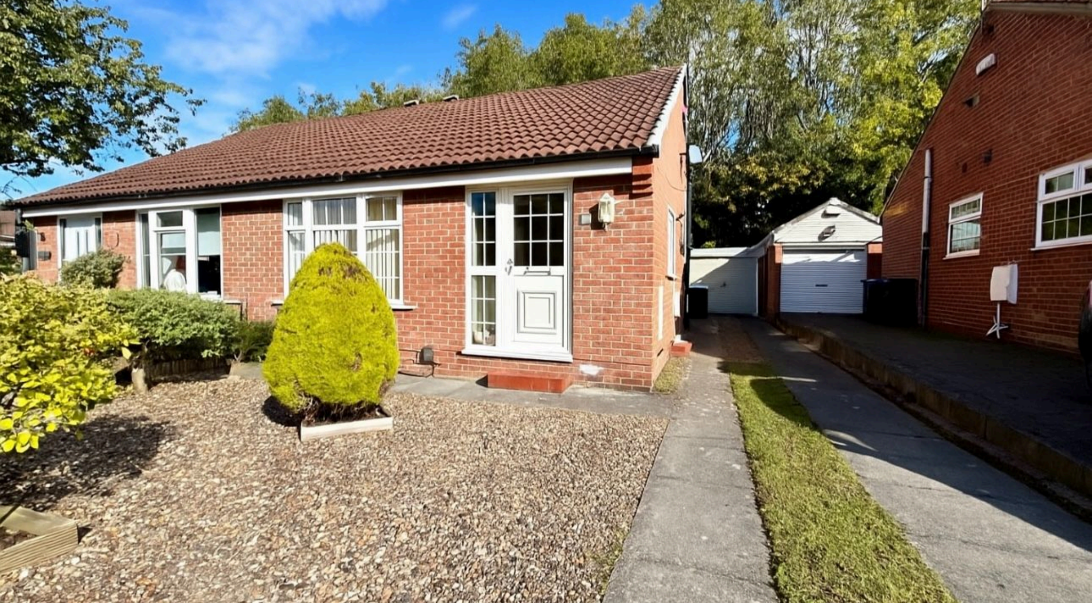
Cedarwood Glade, Stainton