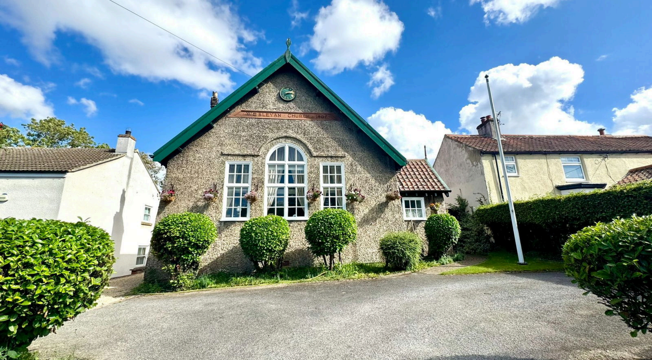
Old Wesleyan Church, West Rounton