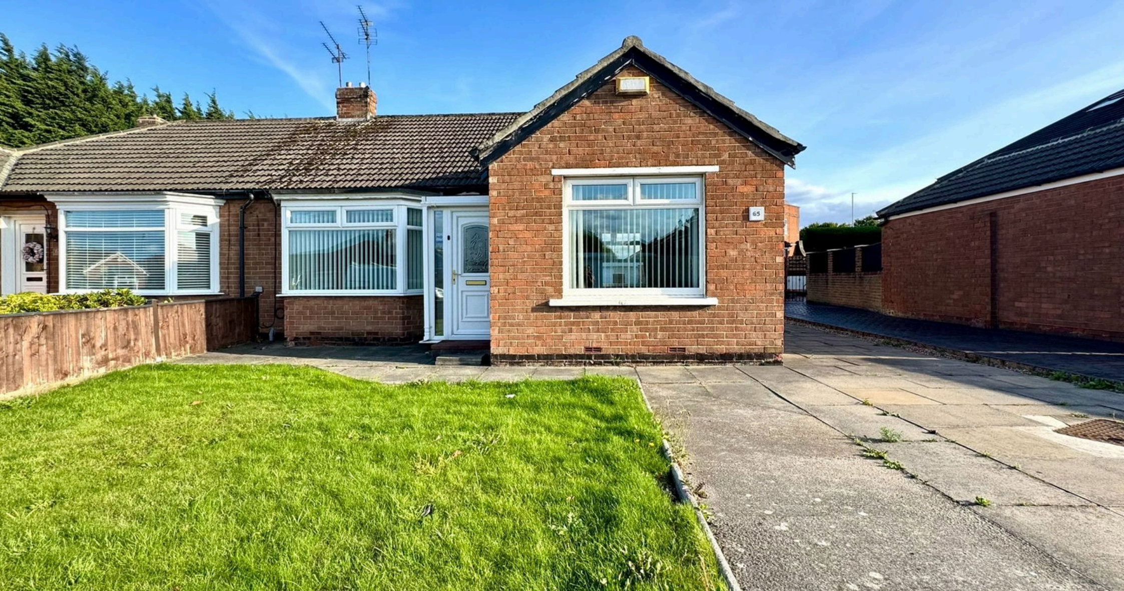
Blue Bell Grove, Acklam